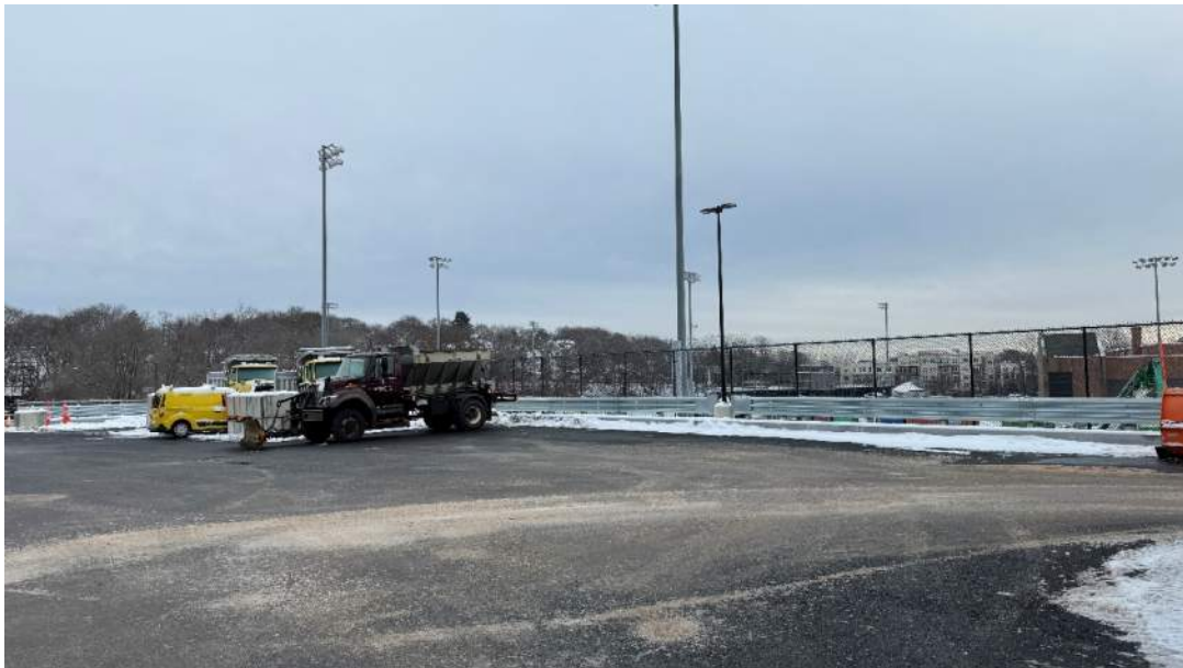
Photo #2 - Upper Site Retaining Wall, Fence and Guardrail (01/09/24)