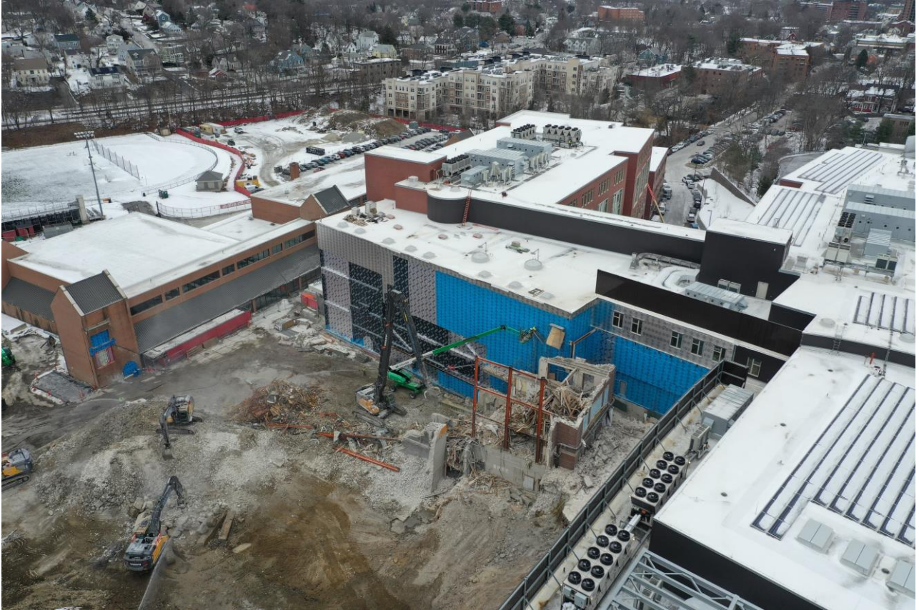
Photograph 1: Aerial View