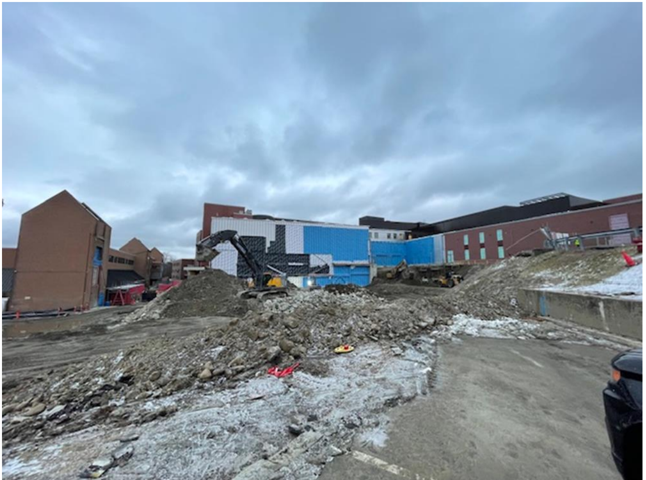
Photograph 2: Phase 3 West Elevation (Schouler Ct)