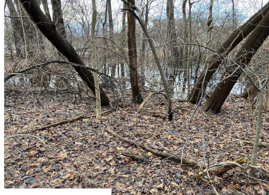
Mugar site @ corner of Dorothy Rd./Littlejohn St.