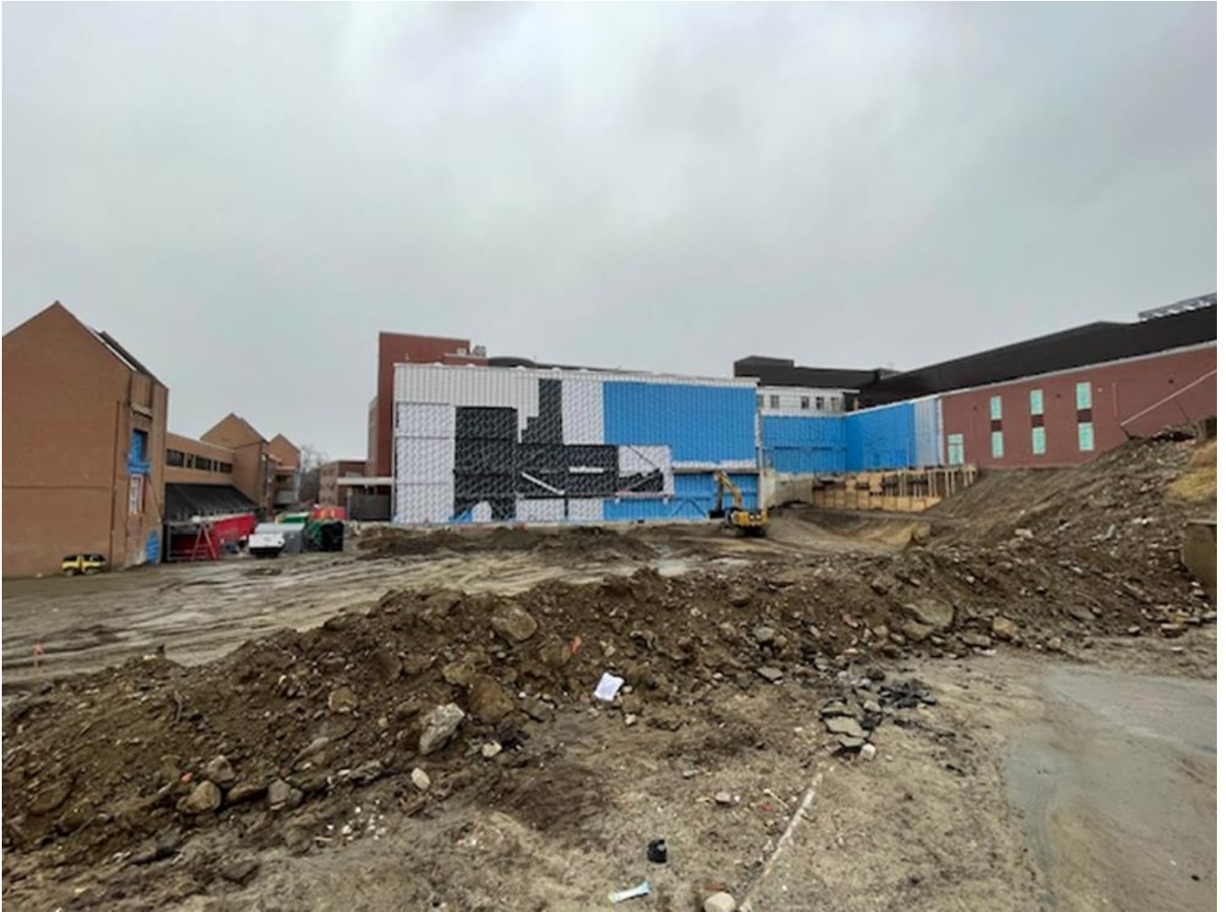
Photograph 1: Phase 3 West Elevation (Schouler Ct)

WEEKLY UPDATE – WEEK OF FEBRUARY 19 TH , 2024