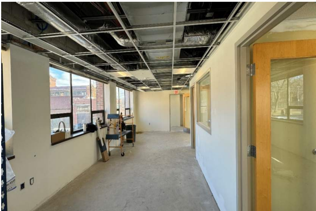
Photo #6 - Building B Second Floor Interior in Progress (02/06/24)