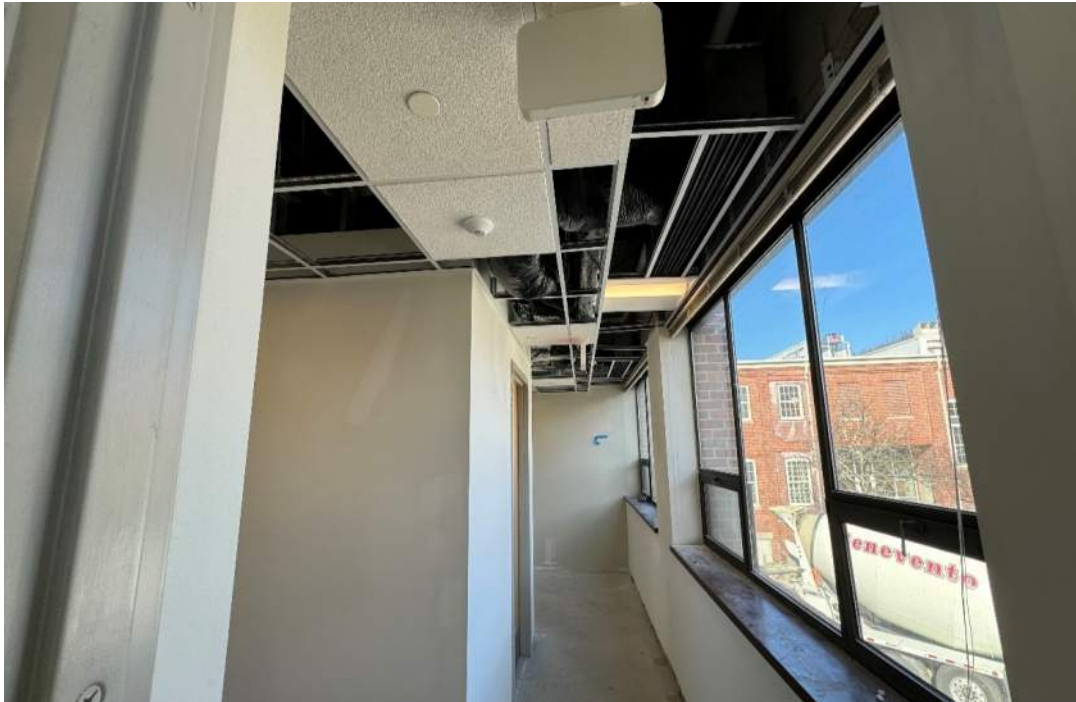
Photo #7 - Building B Second Floor Interior in Progress (02/06/24)