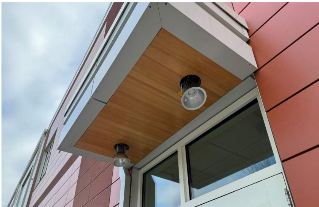
Photo #8 - Building E - Installation of Canopy Underside in Progress (02/06/24)