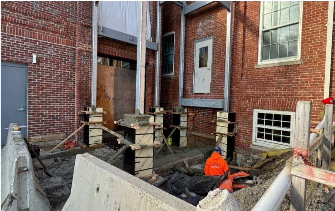
Photo #4 - Building B - Stair Connector Concrete Exposed Base Column in Progress (02/06/24)