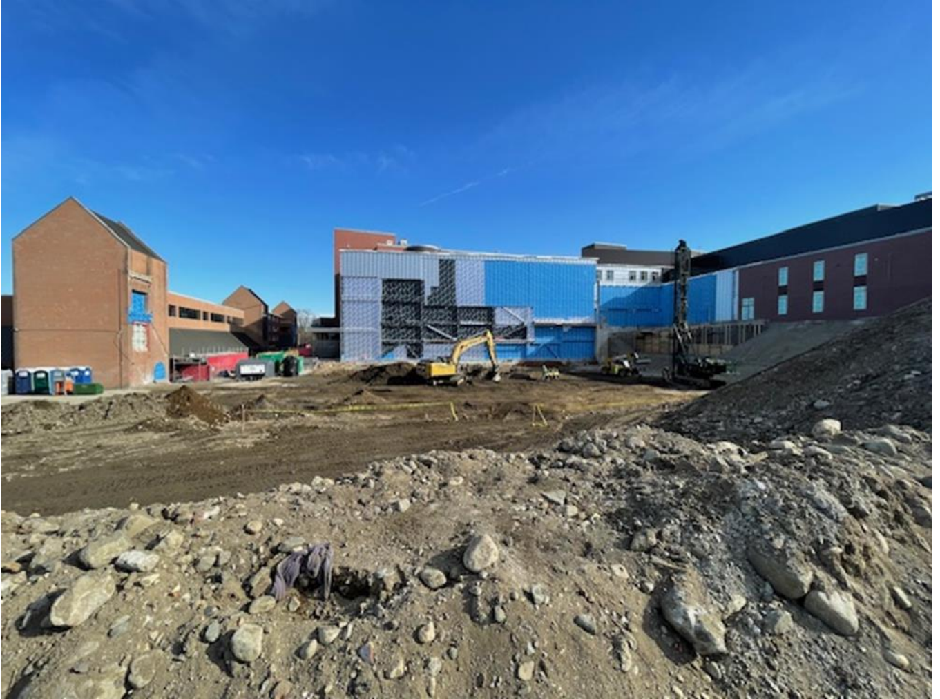
Photograph 1: Phase 3 West Elevation (Schouler Ct)

WEEKLY UPDATE – WEEK OF FEBRUARY 26 TH , 2024