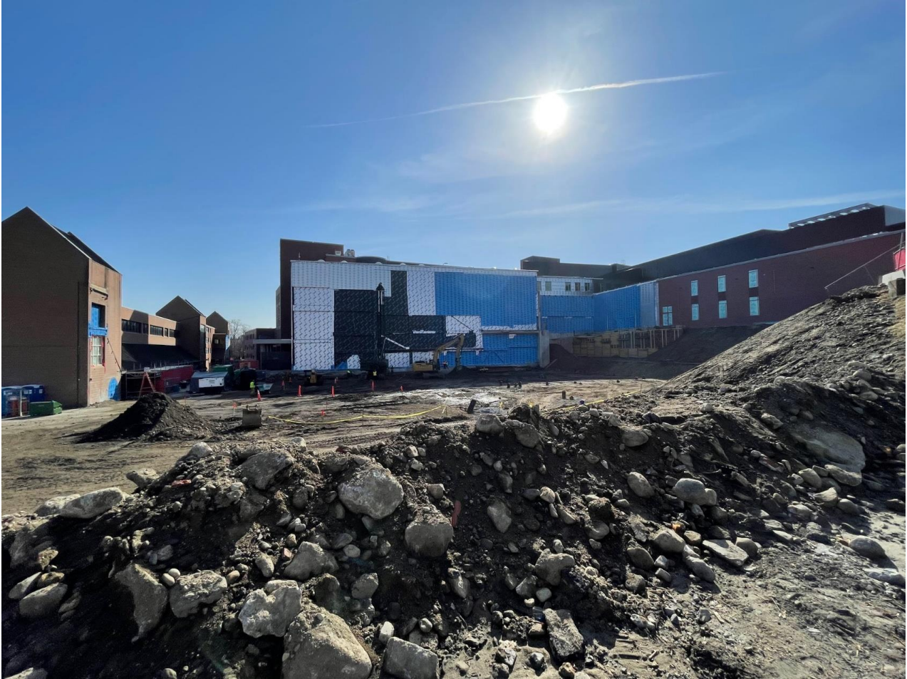
Photograph 3: Phase 3 West Elevation (Scholuer Ct)

WEEKLY UPDATE – WEEK OF MARCH 4 TH , 2024