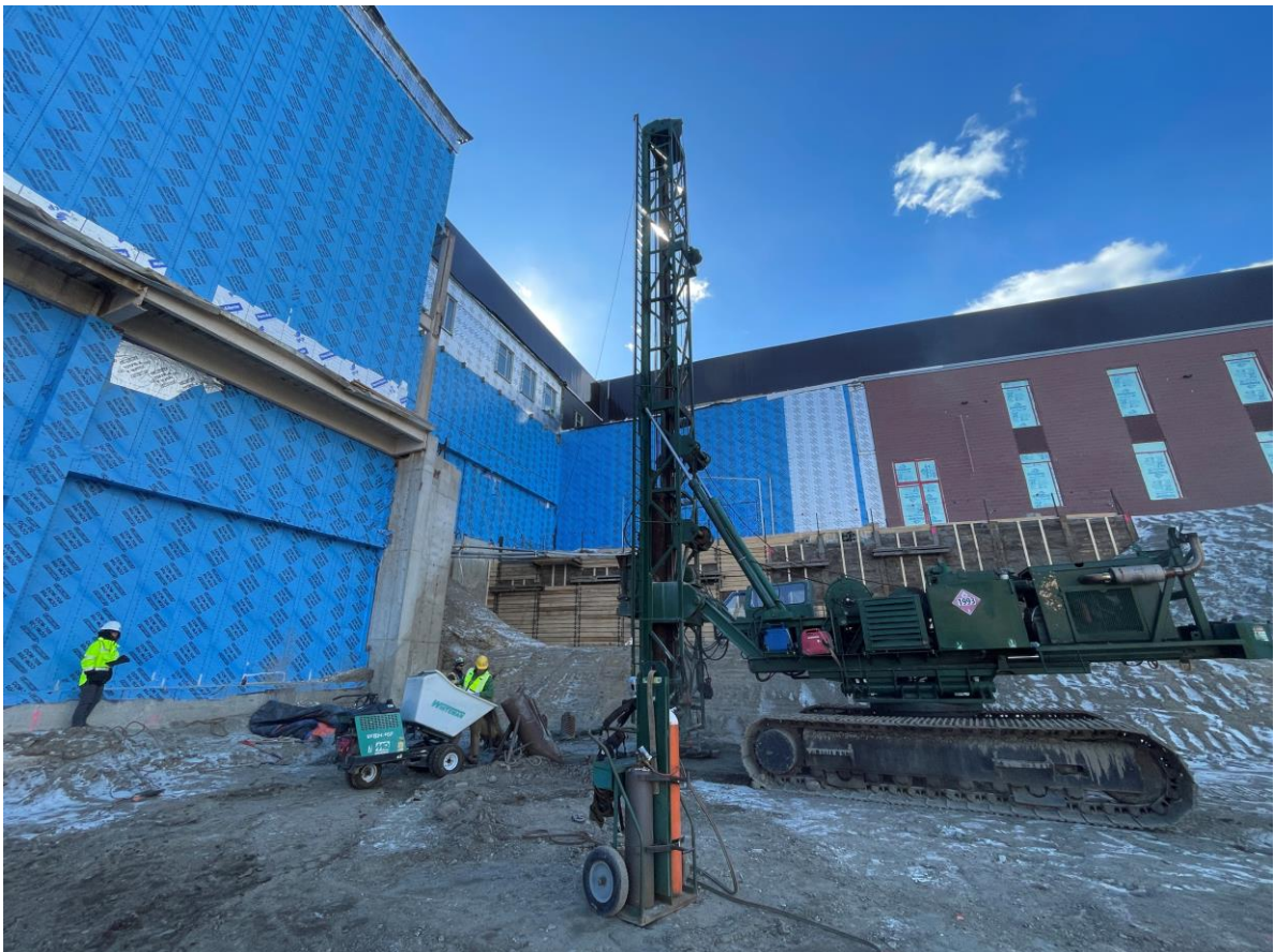
Photograph 2: Phase 3 PIFS driving.