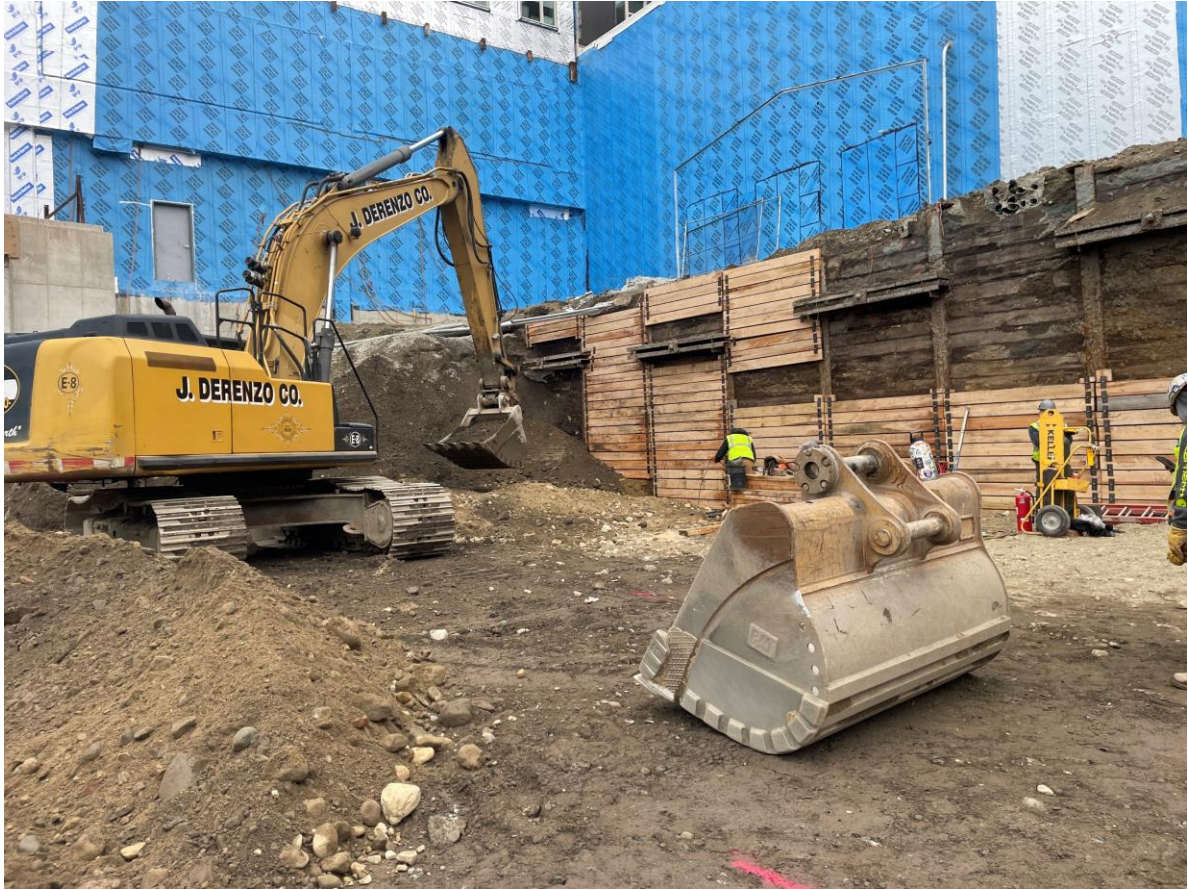
Photograph 1: Phase 3 Temp SOE