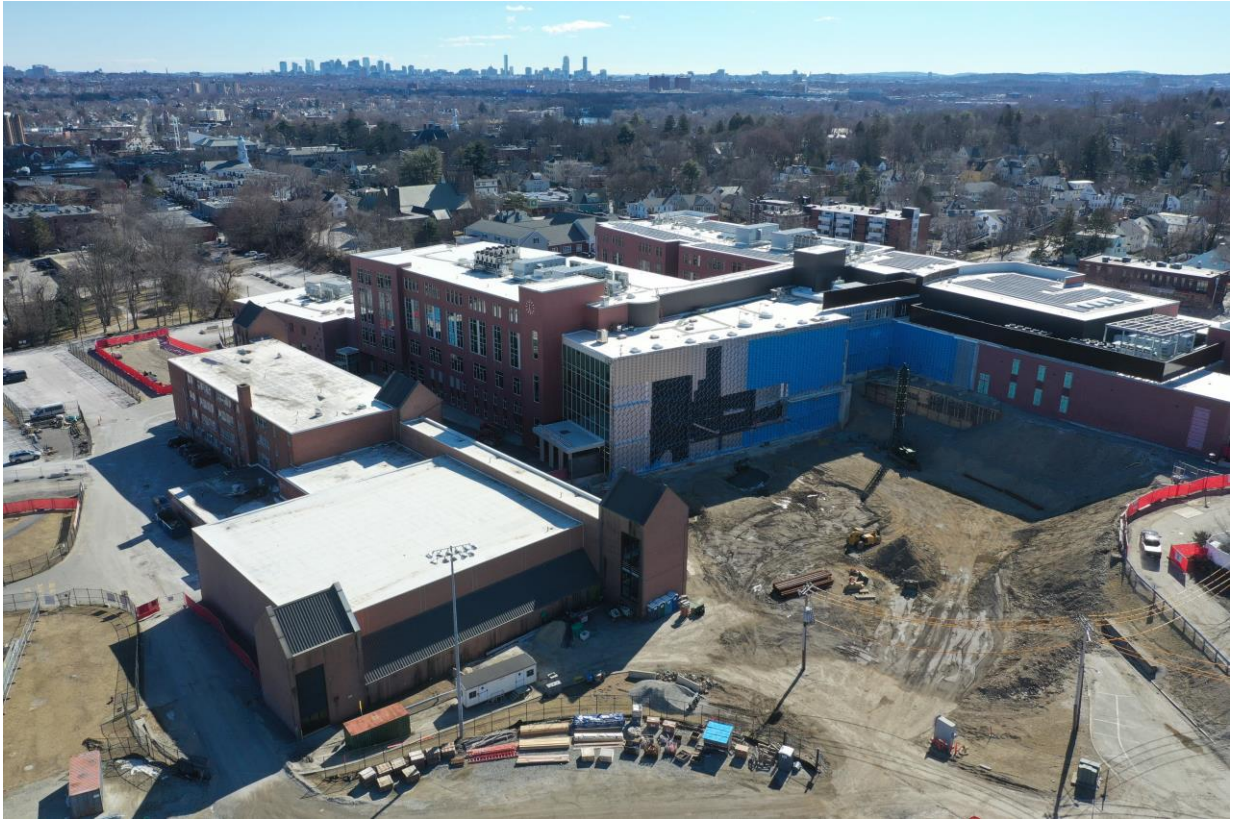
Photograph 1: Phase 3 Aerial View