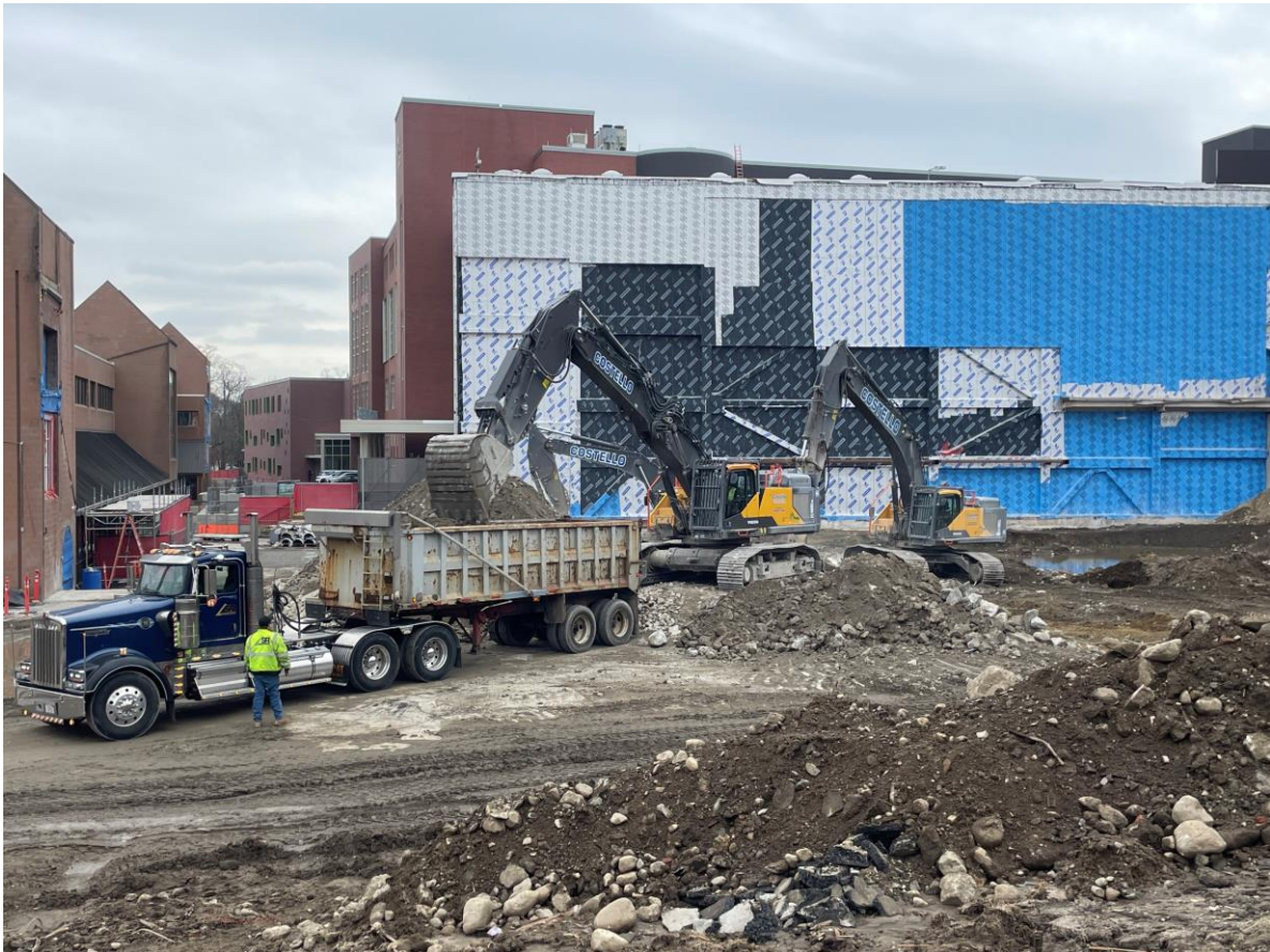
Photograph 2: Phase 3 Excavation.