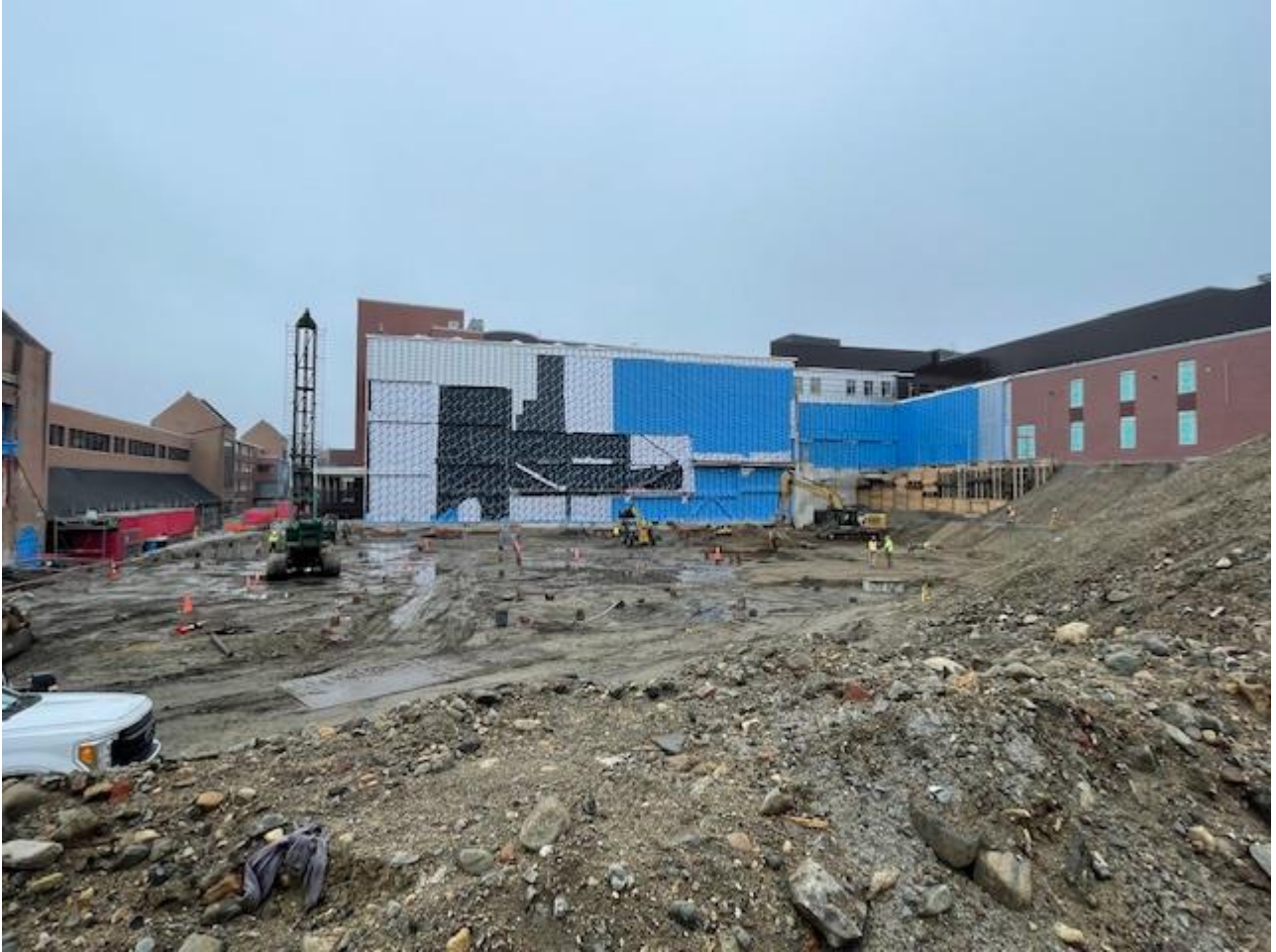
Photograph 3: Phase 3 West Elevation (Scholuer Ct)

WEEKLY UPDATE – WEEK OF MARCH 11 TH , 2024