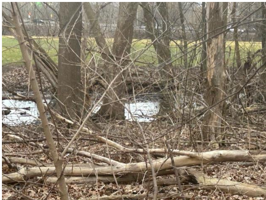
Edge of Thorndike Field March 9, 2024

Without reliable data, we will literally be under water!