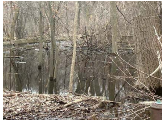
Corner of Edith St. and entrance to Thorndike Field March 9, 2024