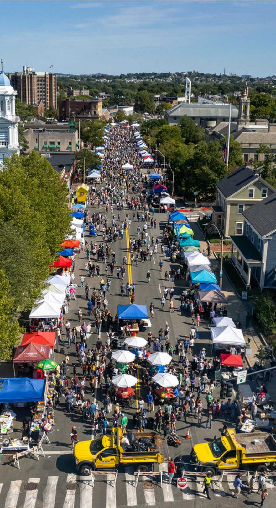
Arlington Town Day, held every September