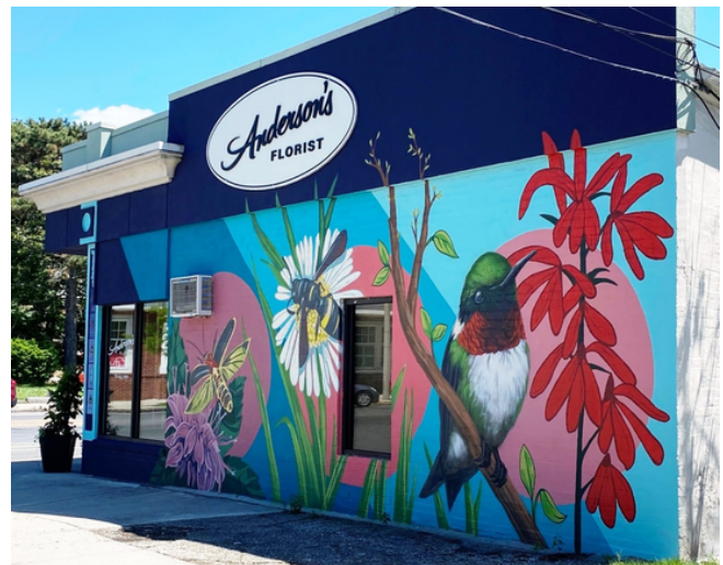
Native Plants and Pollinators mural, 828 Massachusetts Avenue