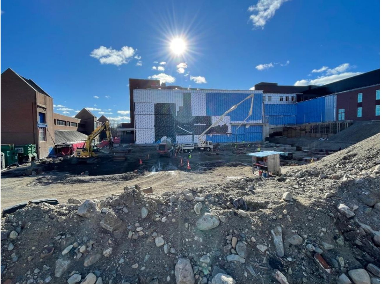
Photograph 1: Phase 3 West Elevation (Scholuer Ct)

WEEKLY UPDATE – WEEK OF MARCH 25 TH , 2024