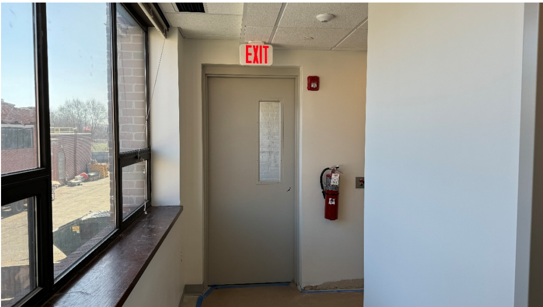
Photo #4 - Building B – Level One - Fire Alarm Install Complete -Painting in Progress (03/12/24)