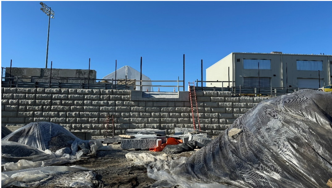
Photo #5 - Building B - Trash Chute Install in Progress (03/12/24)