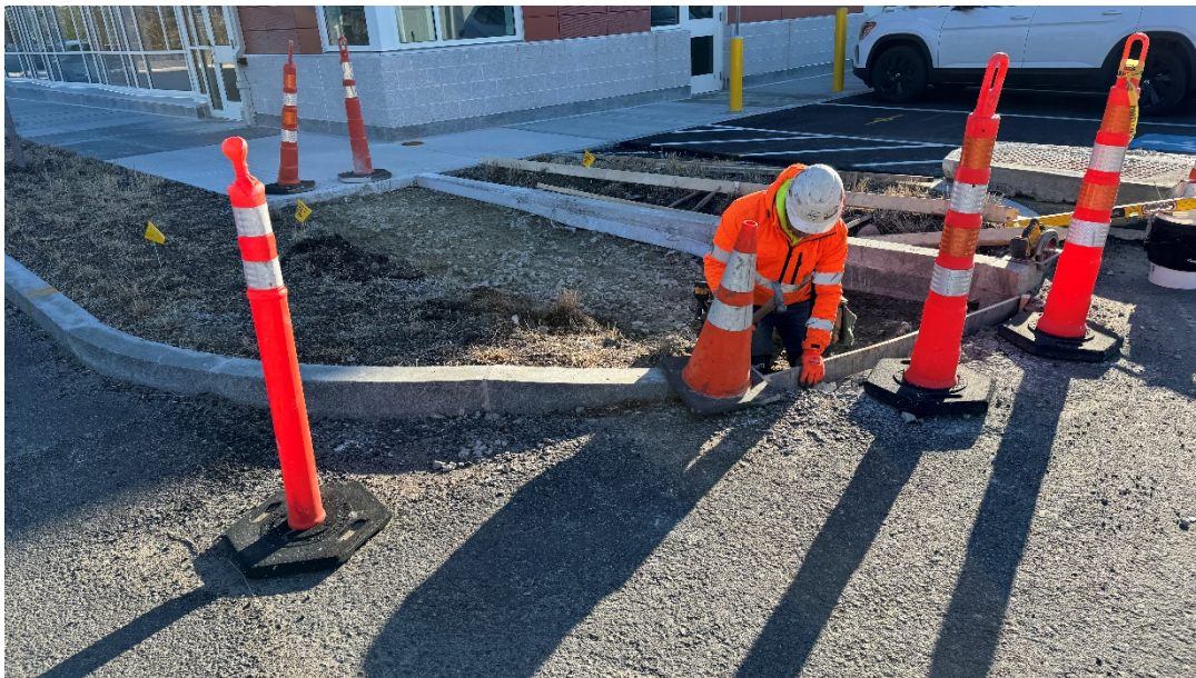
Photo #6 - Upper Site Entrance - Ramp and Curb Install in Progress (03/12/24)