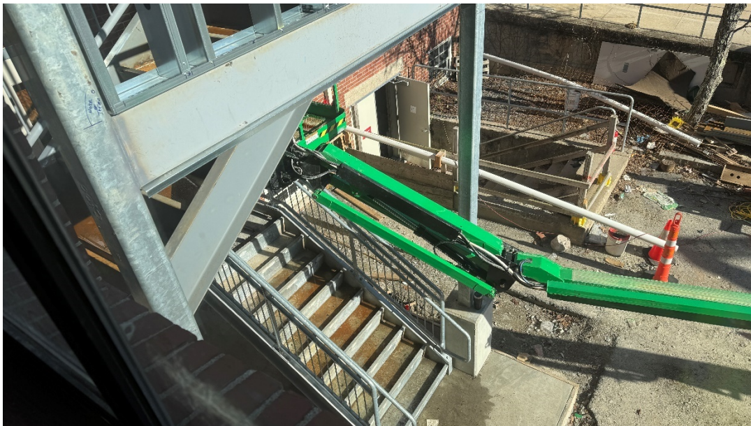
Photo #2 - Building A/B Connector - Stair Install in Progress (03/12/24)