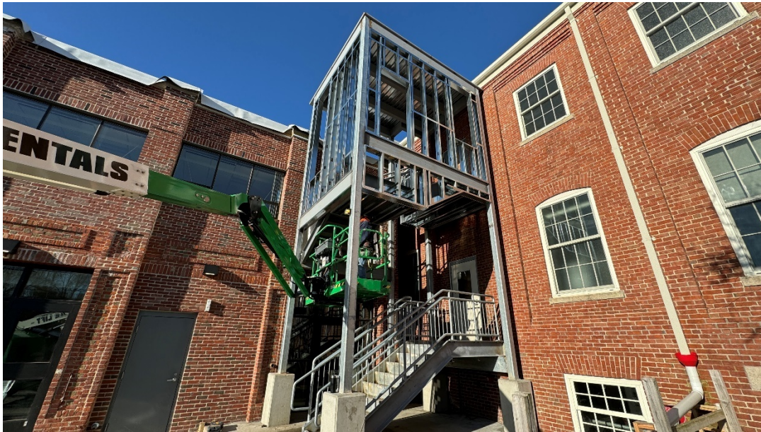
Photo #1 - Building A/B Connector Stair Install in Progress (03/12/24)