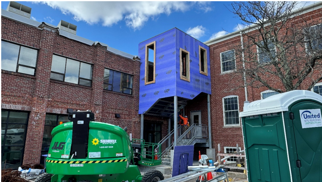
Photo #7 - Building A/B Connector - Stair Install in Progress (03/19/24)