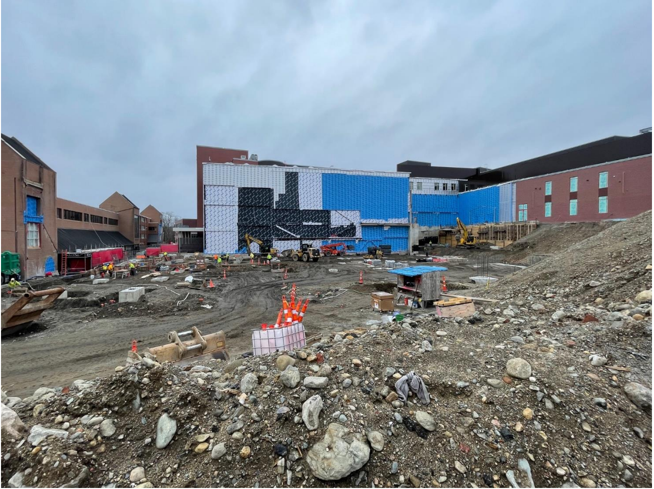
Photograph 1: Phase 3 West Elevation (Scholuer Ct)