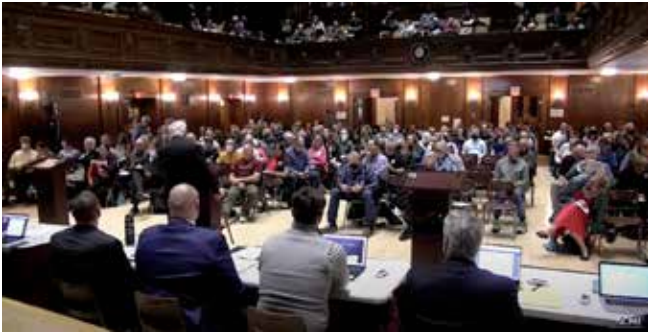
A view of in-person fall Special Town Meeting, October 2023.