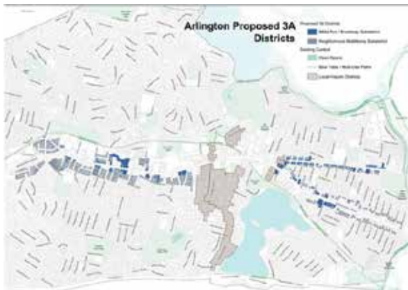
MBTA Communities Overlay Districts (Article 12)

Among the several zoning articles in the Warrant, the most significant was the MBTA Communities Overlay Districts (Article 12). This article sought to create 2 multi-family housing overlay districts: the Massachusetts Avenue/Broadway Multi-Family (MBMF) Overlay District and the Neighborhood Multi-Family (NMF) Overlay District. 13 amendments were offered by 9 Town Meeting Members to amend the recommended vote of the Arlington Redevelopment Board; one of those amendments passed, 11 failed, and one was withdrawn. The article was deliberated for about four hours over two evenings, passing 189-35.