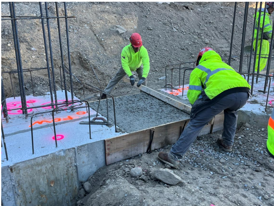
Photograph 2: Concrete pour of grade beams & pile caps.