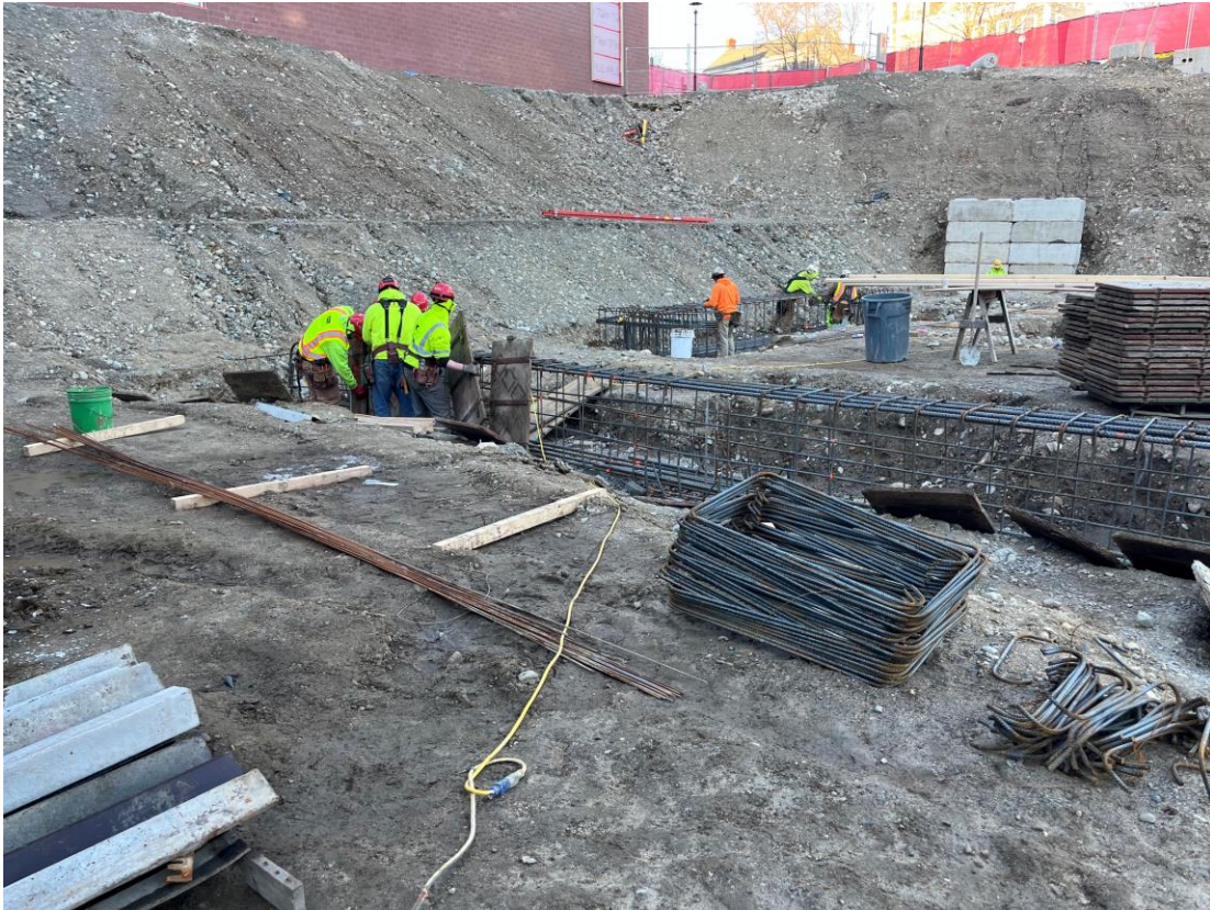
Photograph 1: Grade beams rebar tie-in and formwork.