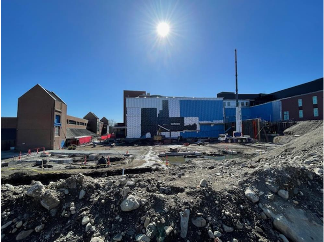
Photograph 3: Phase 3 West Elevation (Scholuer Ct)

WEEKLY UPDATE – WEEK OF APRIL 15 TH 2024