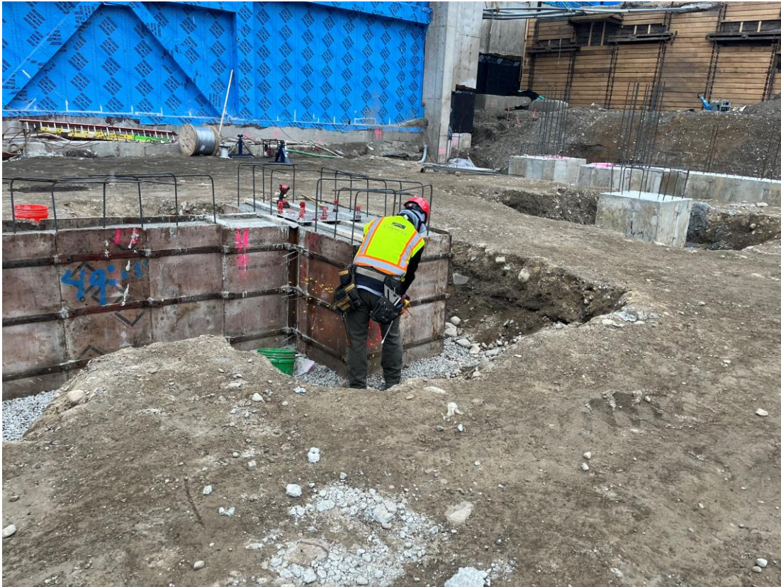
Photograph 1: Formwork Strip of poured grade beams and pile caps.