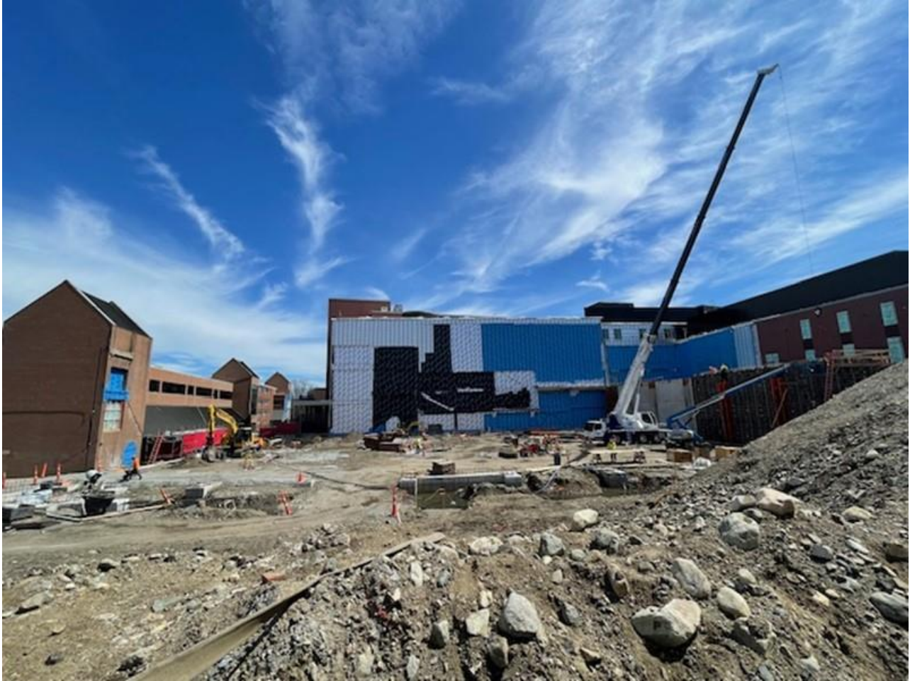
Photograph 3: Phase 3 West Elevation (Scholuer Ct)

WEEKLY UPDATE – WEEK OF APRIL 22 ND 2024