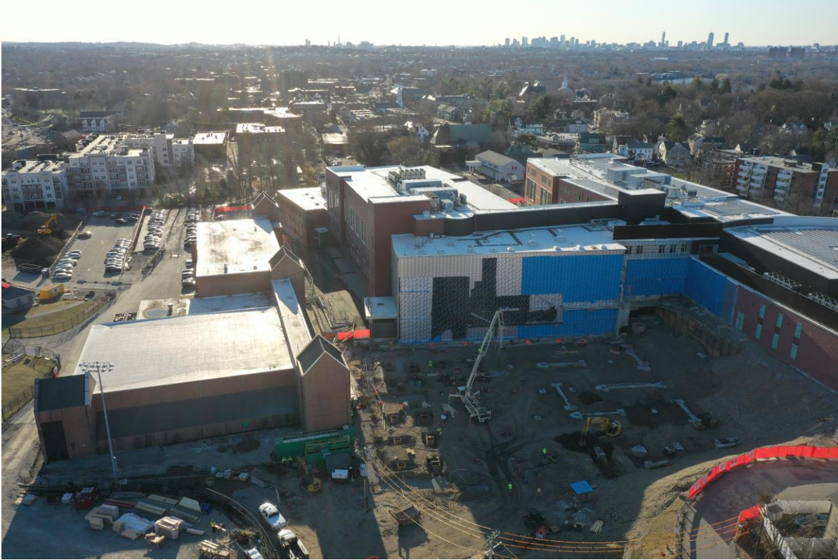
Photograph 1: Aerial view of concrete grade beams and pile caps.