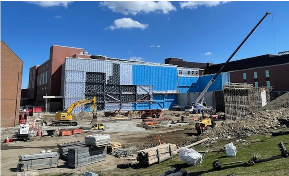
Photograph 2: West Elevation (Schouler Ct)