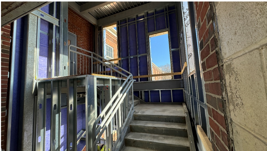
Photo #2 - Building A/B Connector – Interior Stud Framing Install in Progress (04/09/24)