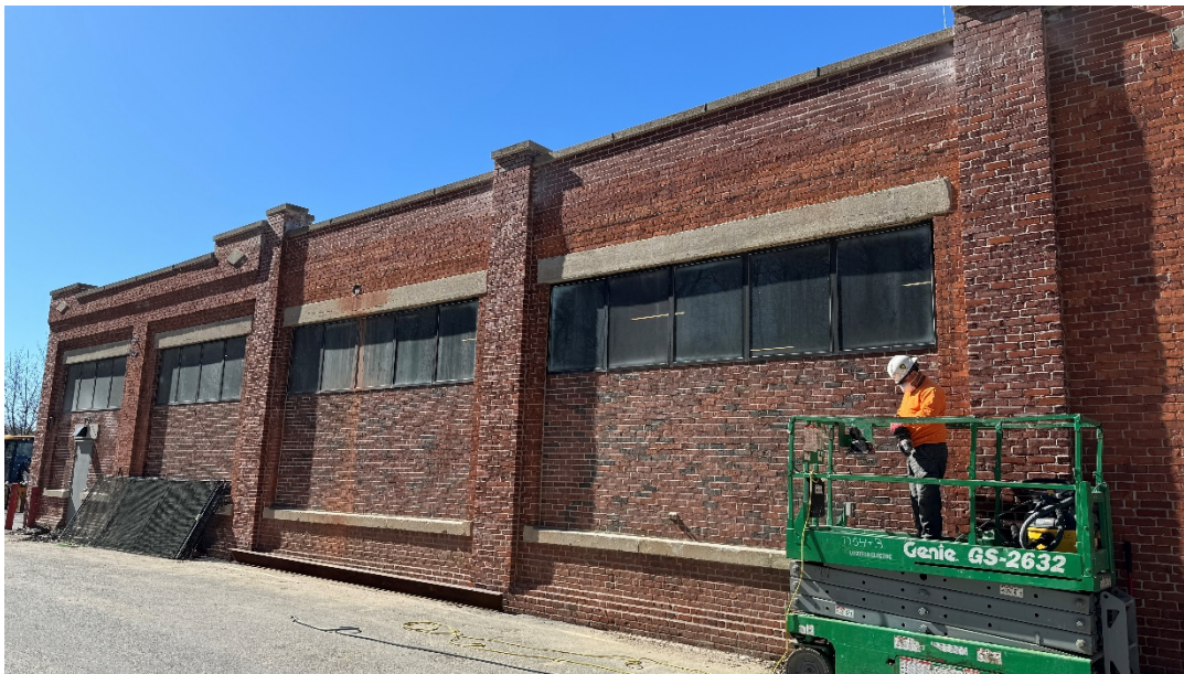
Photo #1 - Building D – Column Repaired, Cleaned and Completed (04/16/24)