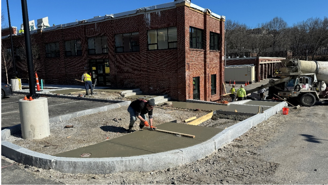
Photo #3 - Upper Site - Concrete Stair Install in Progress (04/09/24)