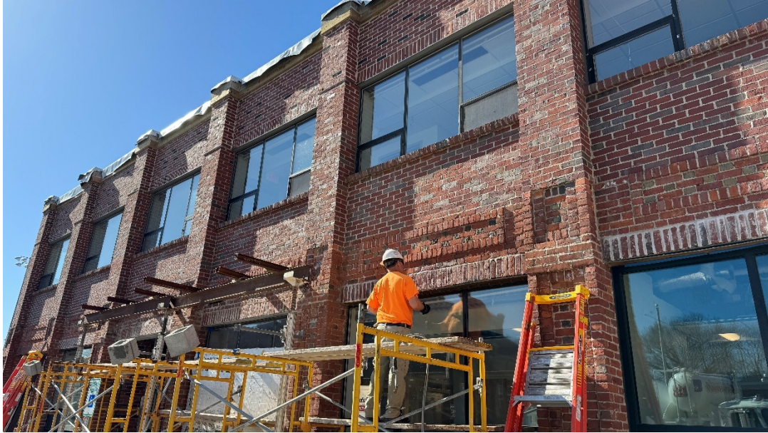
Photo #5 - Building B – Shoring Removal and Brick Cleaning in Progress (04/09/24)