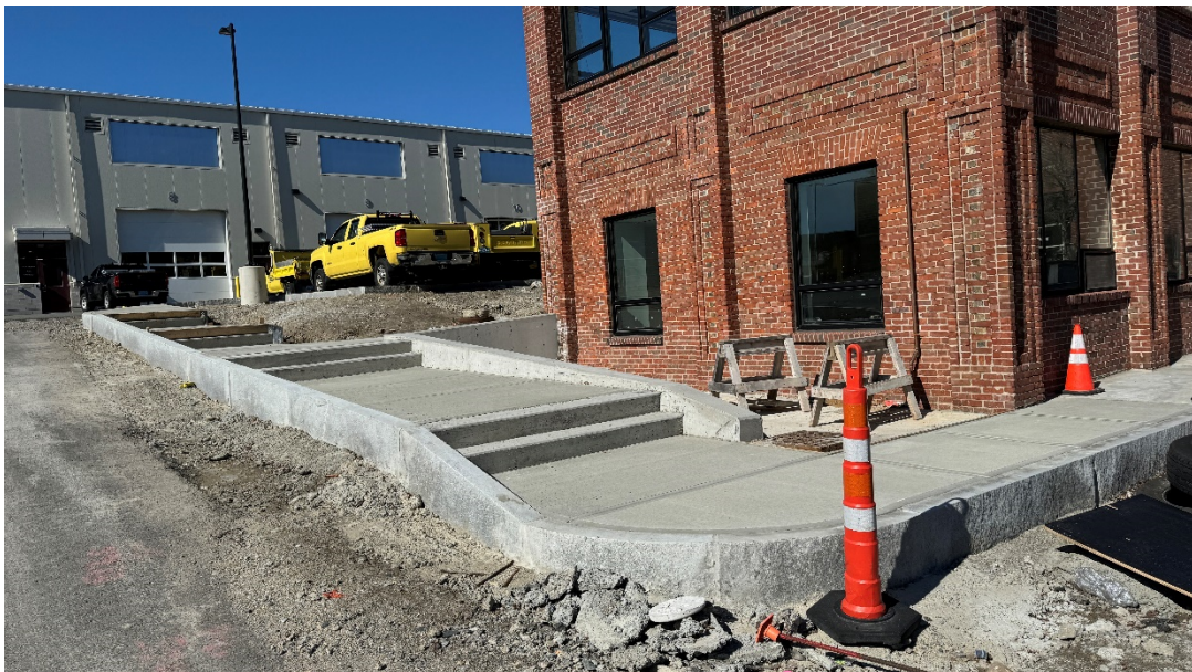
Photo #4 - Upper Site - Concrete Stair Install in Progress (04/16/24)