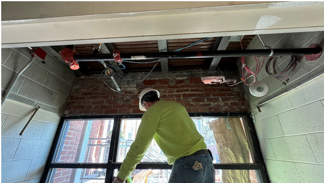
Photo #6 - Building B – Lintel Install – Brick Repair in Progress (04/09/24)