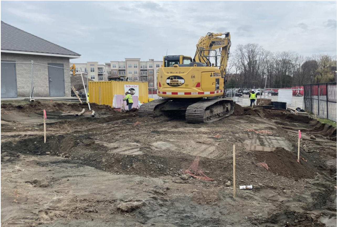
Photograph 3: Excavation of future toilet facility building.