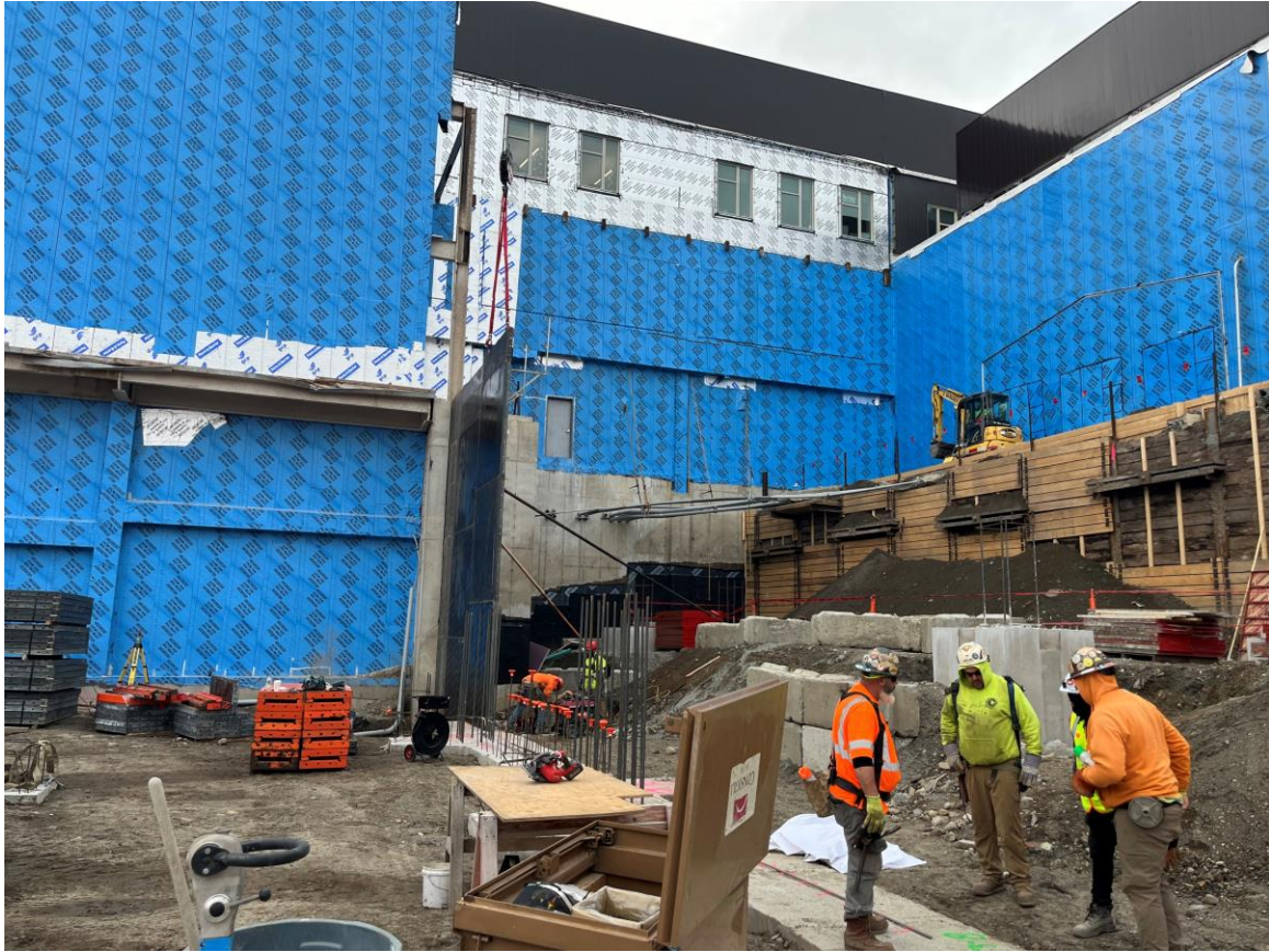
Photograph 1: Formwork and rebar tie-in of high wall.