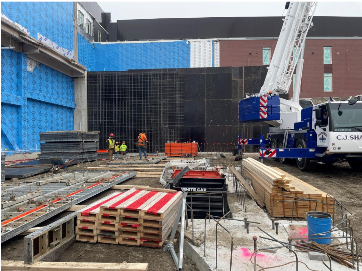
Photograph 2: Continuing formwork of high wall.