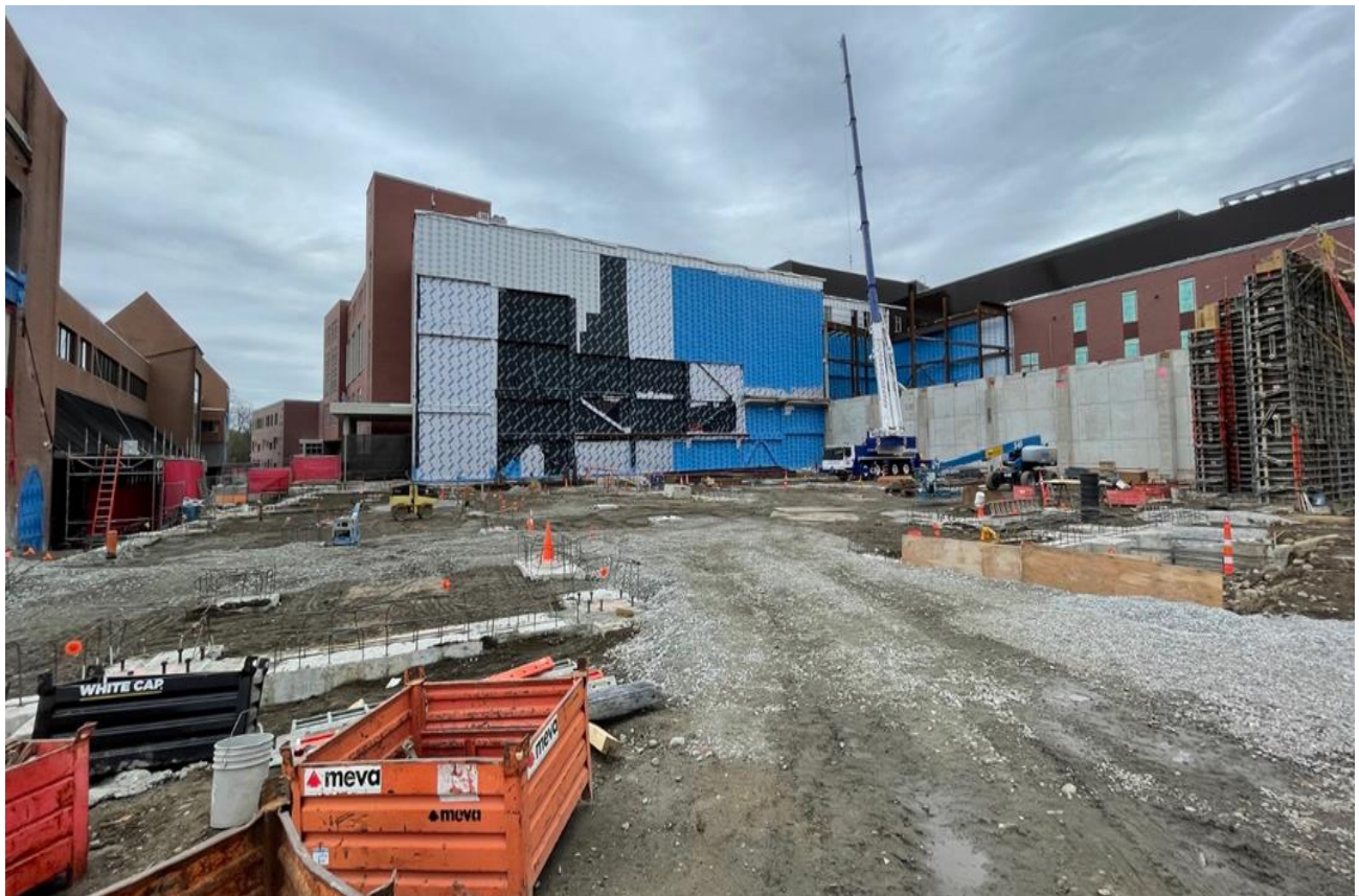
Photograph 4: West Elevation (Schouler Ct)