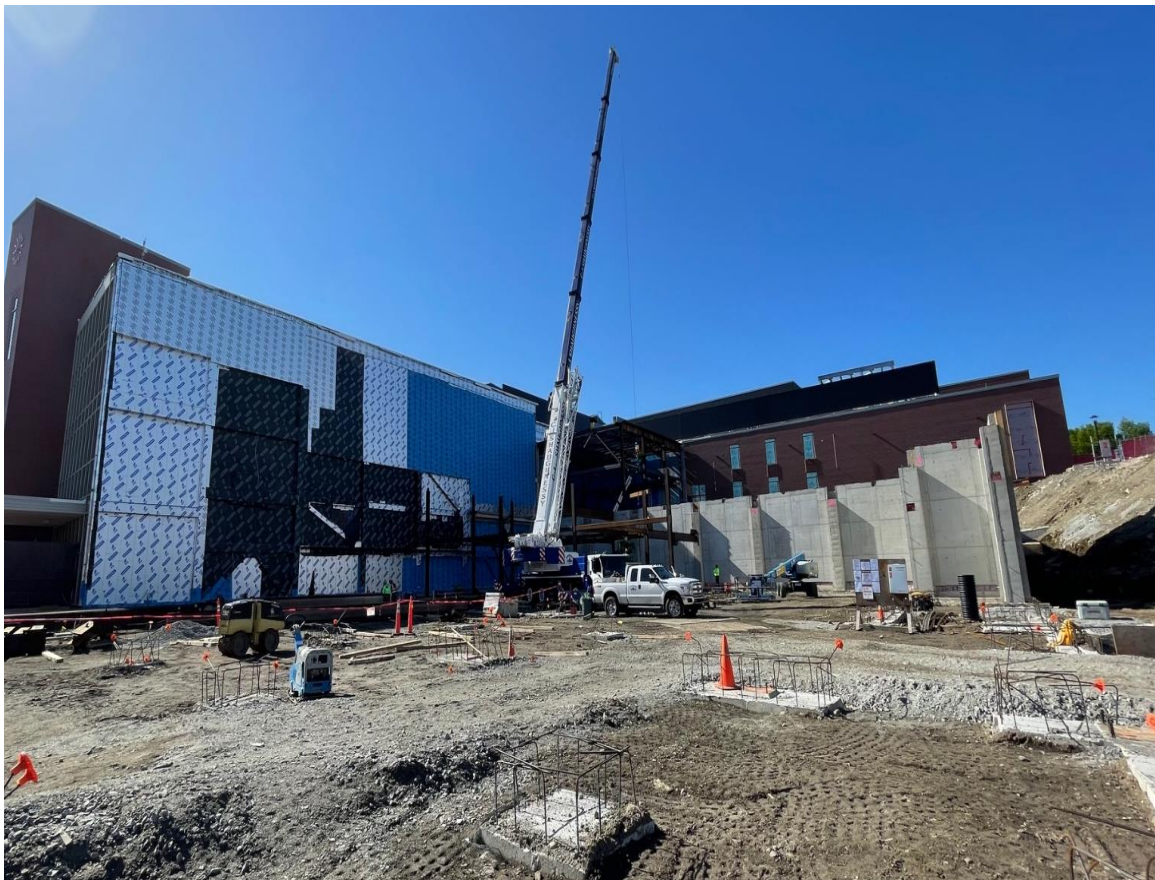
Photograph 4: West Elevation (Schouler Ct)