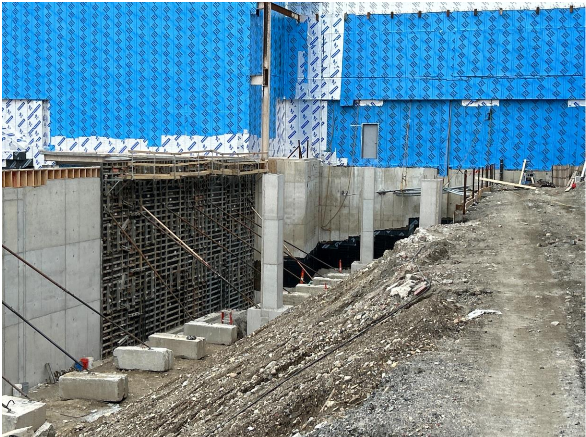
Photograph 2: Concrete columns of Black Box Theater.