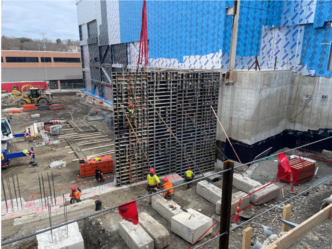
Photograph 1: Formwork and rebar tie-in of high wall.