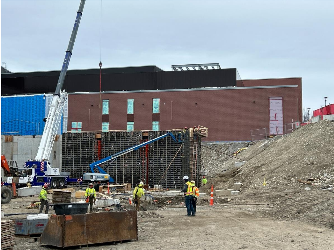
Photograph 3: Elevation view of high wall.