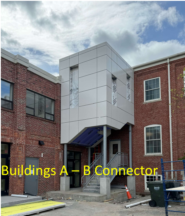
Buildings A – B Connector