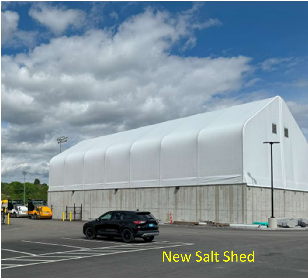
New Salt Shed