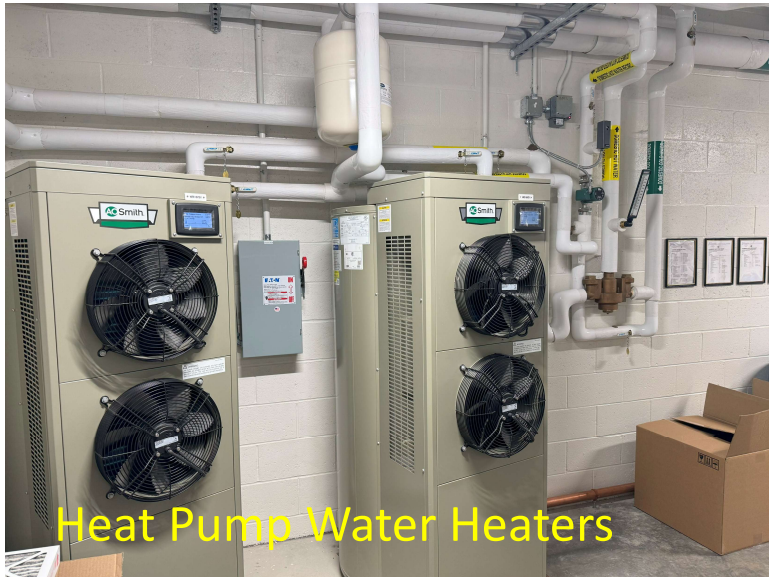
Heat Pump Water Heaters