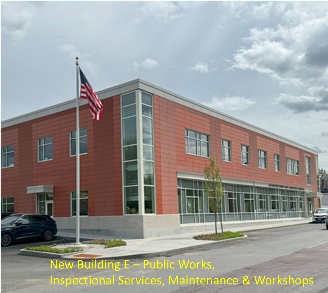
New Building E – Public Works, Inspectional Services, Maintenance & Workshops