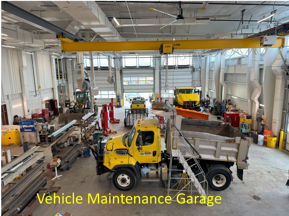
Vehicle Maintenance Garage