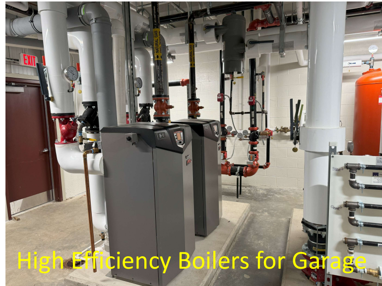
High Efficiency Boilers for Garage