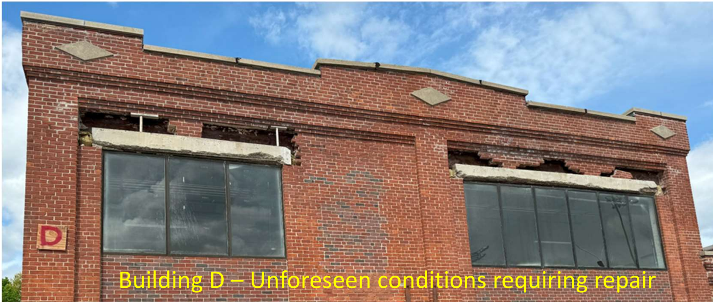
Building D – Unforeseen conditions requiring repair