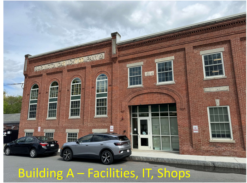
Building A – Facilities, IT, Shops