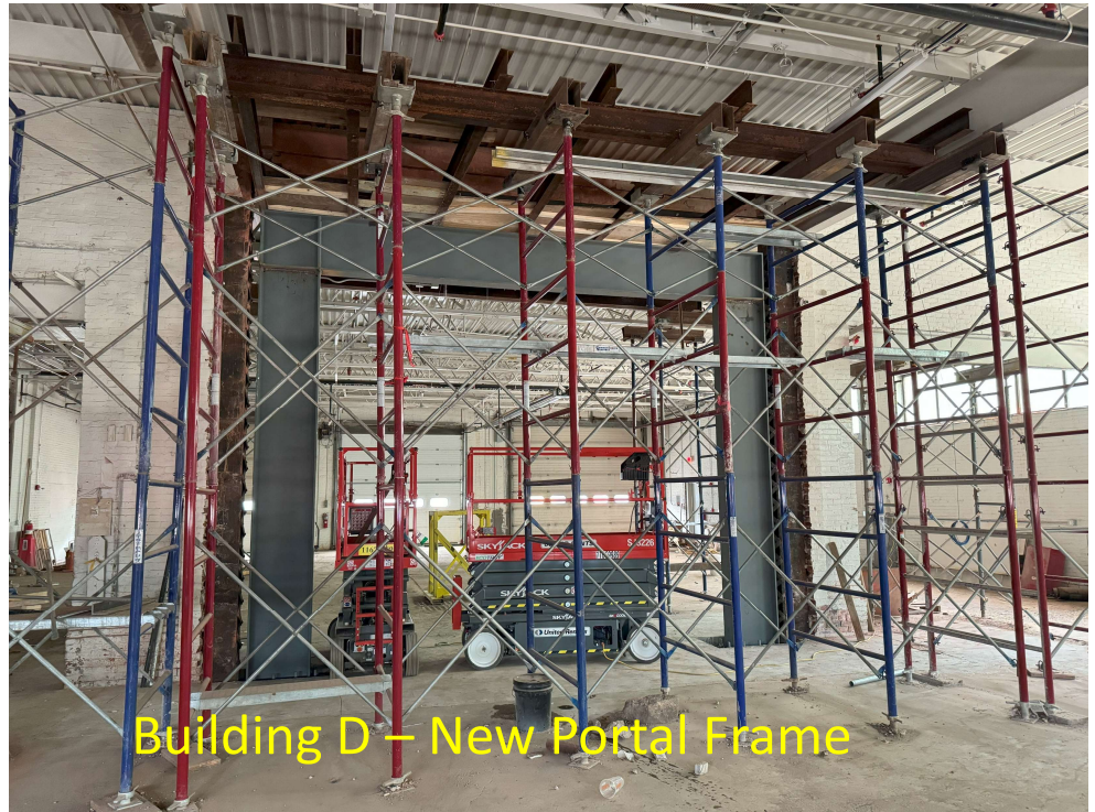
Building D – New Portal Frame