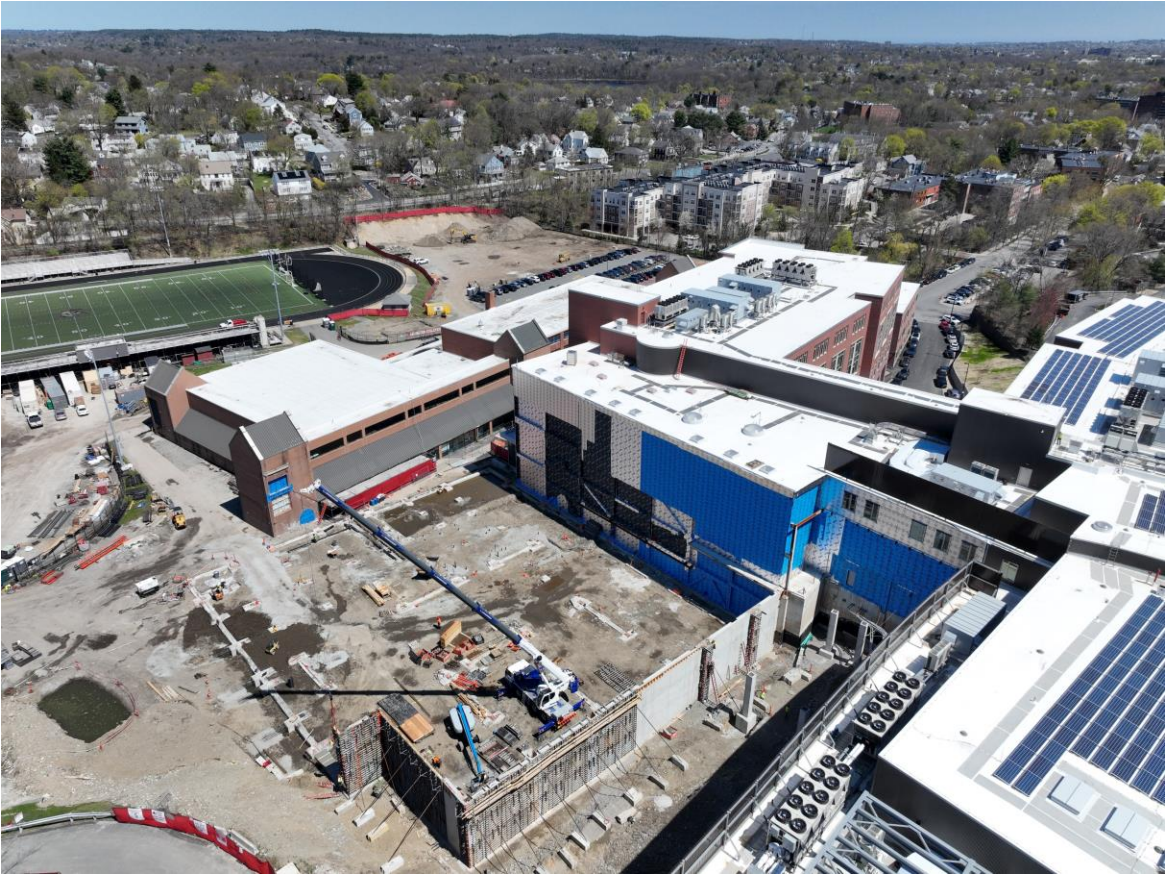
Photograph 3: Birdseye view of project footprint.