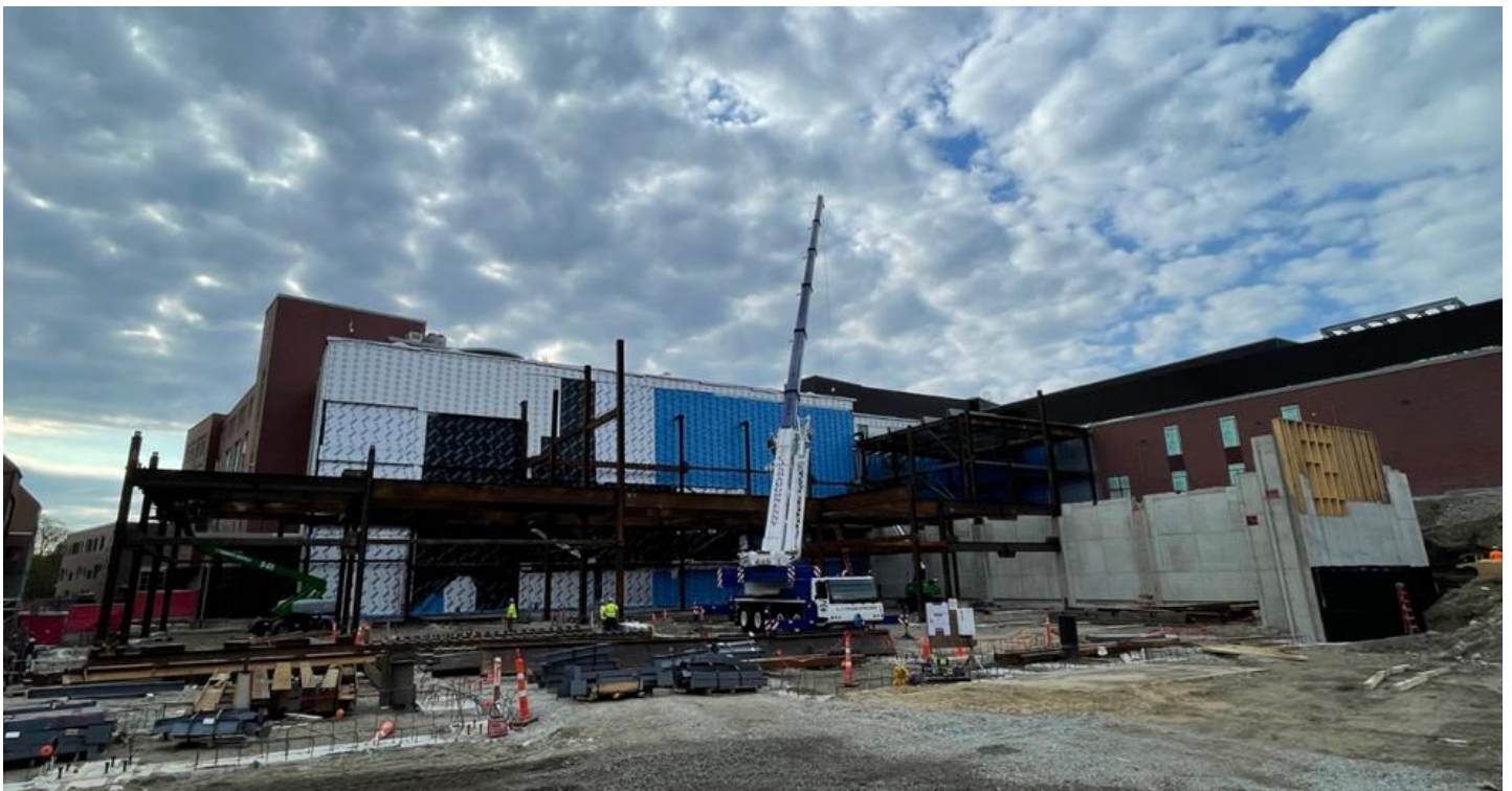
Photograph 4: West Elevation (Schouler Ct)