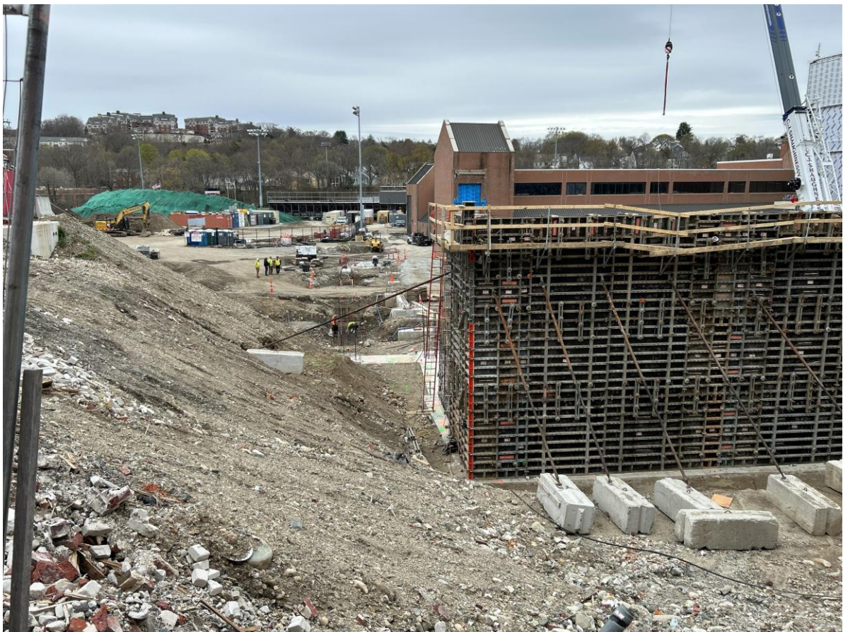
Photograph 2: Corner of high wall.