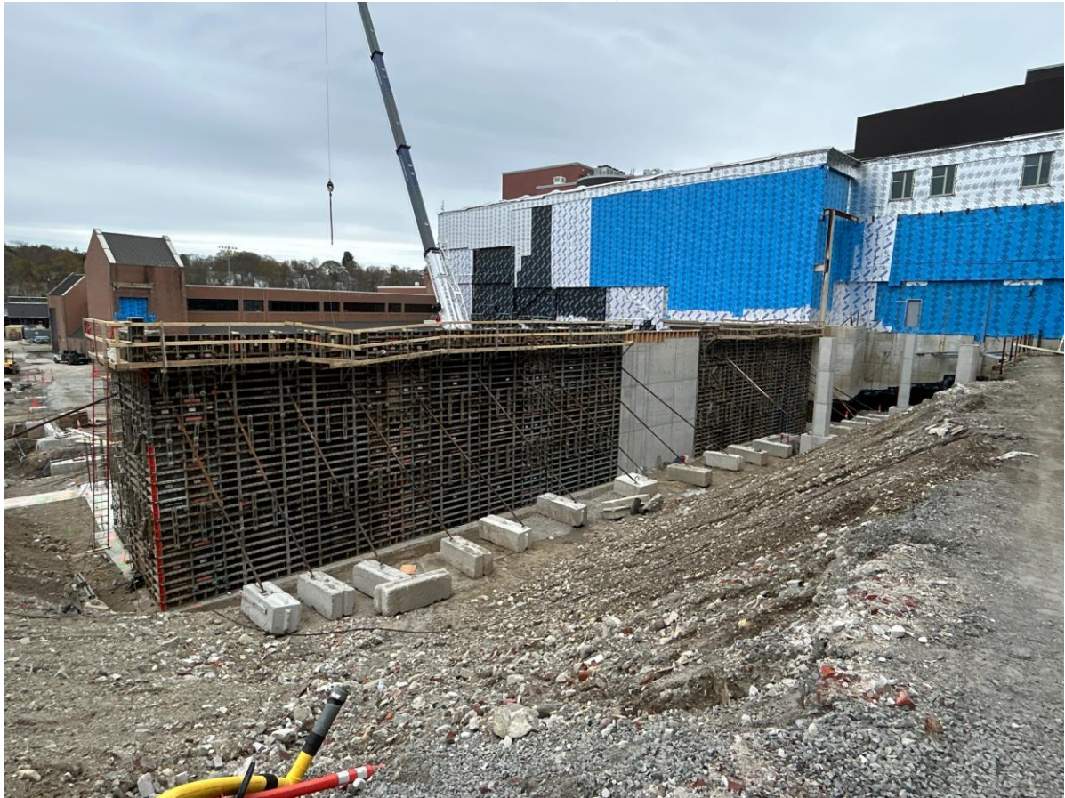
Photograph 1: Formwork and rebar tie-in of high wall.