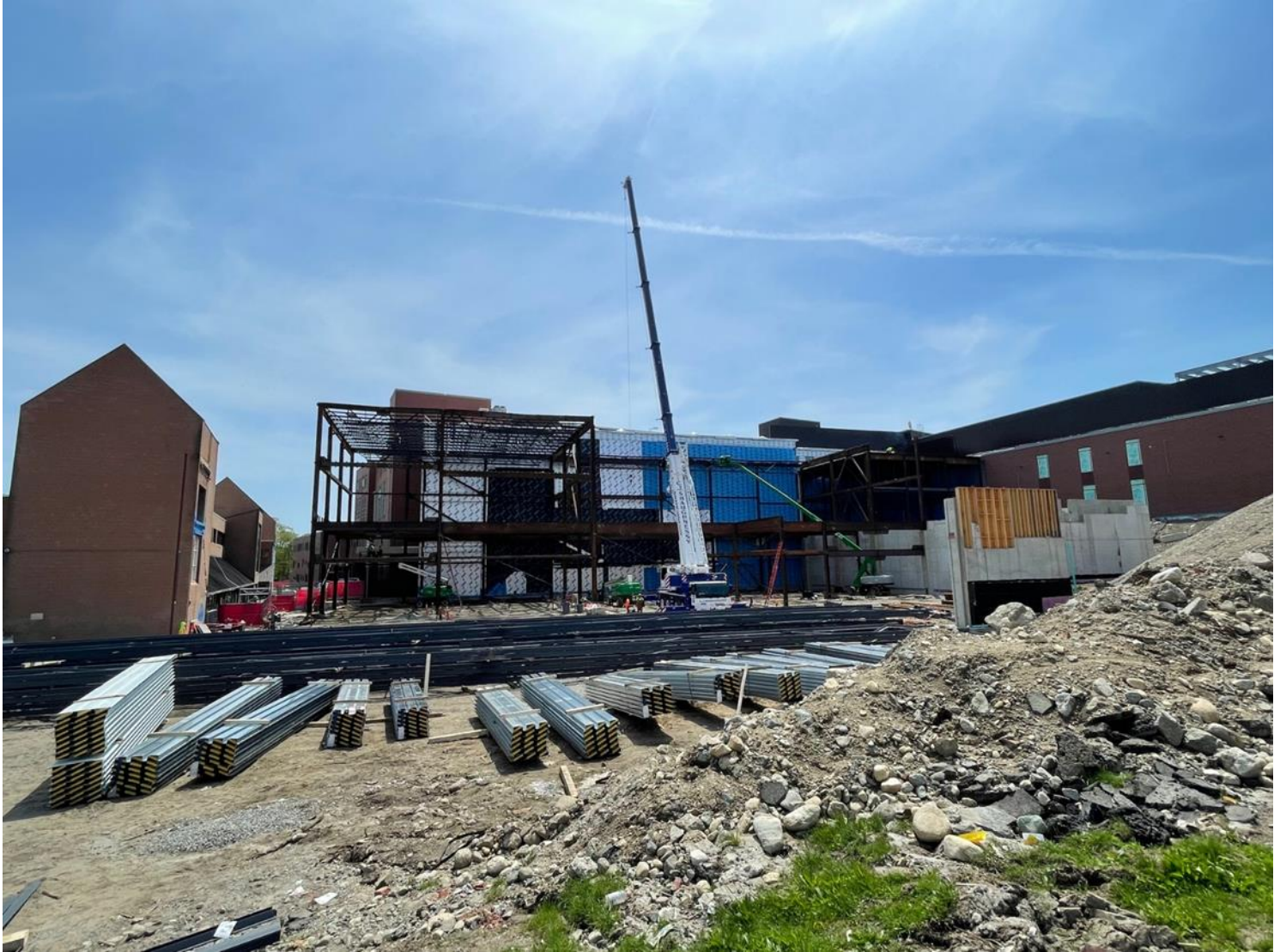
Photograph 1: West Elevation (Schouler Ct)

WEEKLY UPDATE – WEEK OF MAY 27 TH , 2024