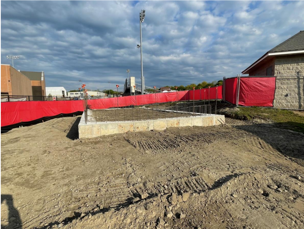
Photograph 3: Toilet Building Facility Footing Footprint