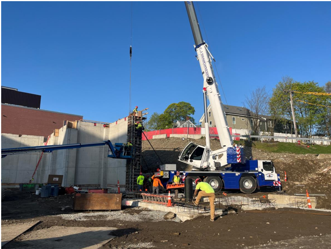
Photograph 2: View of High Wall from Inside footprint