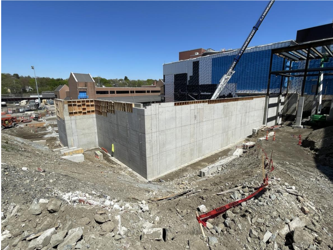
Photograph 1: North Elevation of Foundation Wall