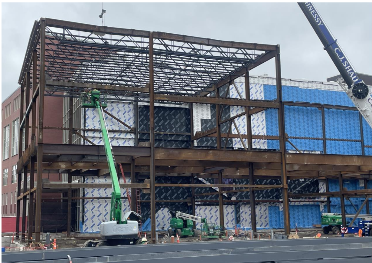
Photograph 2: Elevation of level 2 and roof truss structural steel erection.