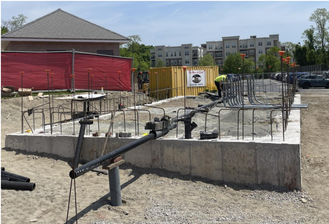
Photograph 3: Toilet Building Facility underground Plumbing and Electrical Rough.