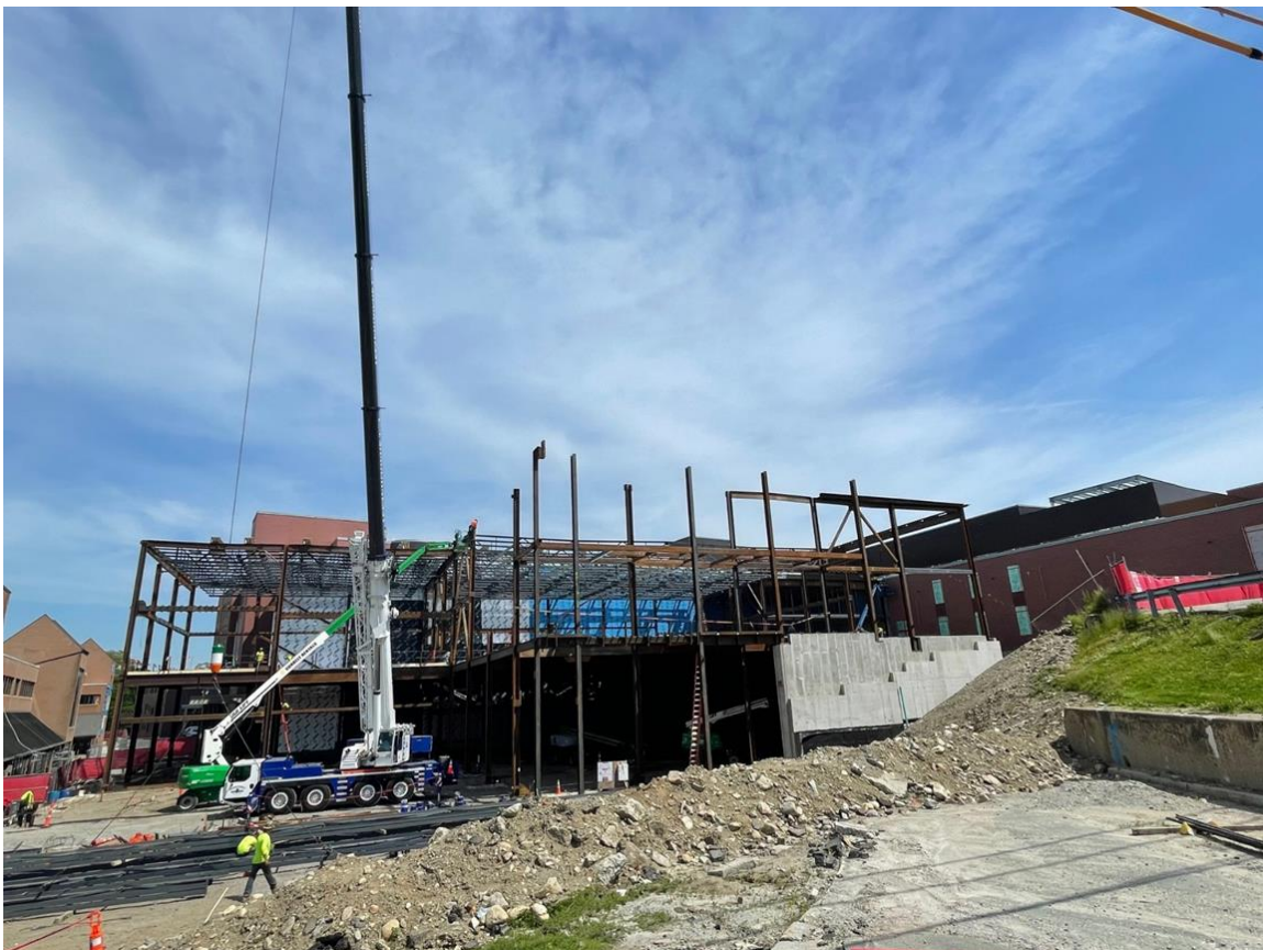
Photograph 4: West Elevation (Schouler Ct)