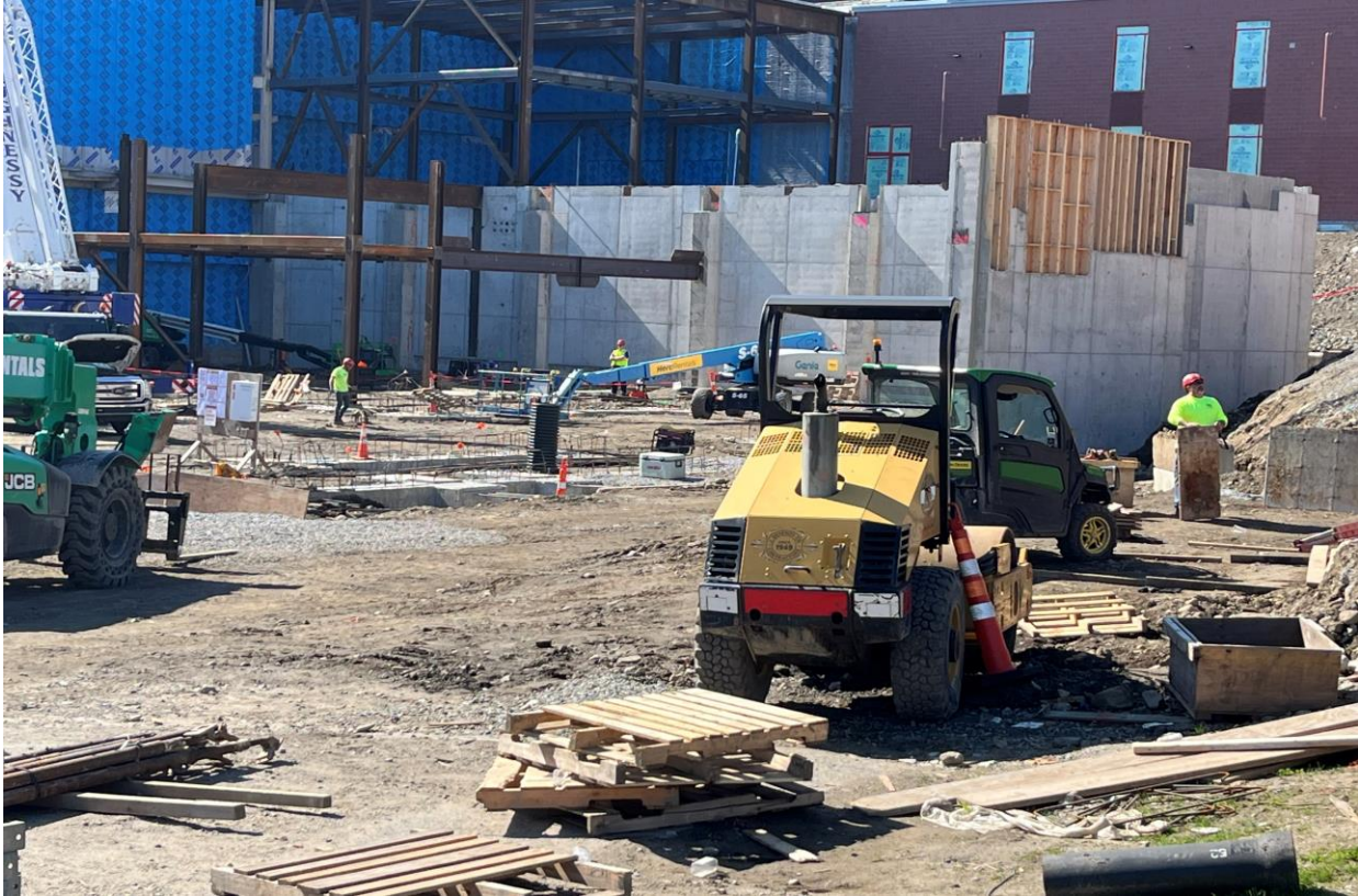
Photograph 1: Elevation of Level 1 structural erection.