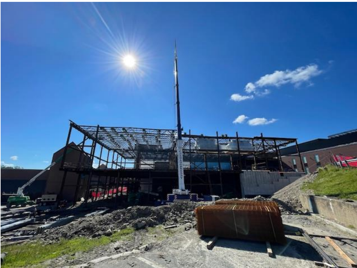
Photograph 4: West Elevation (Schouler Ct)