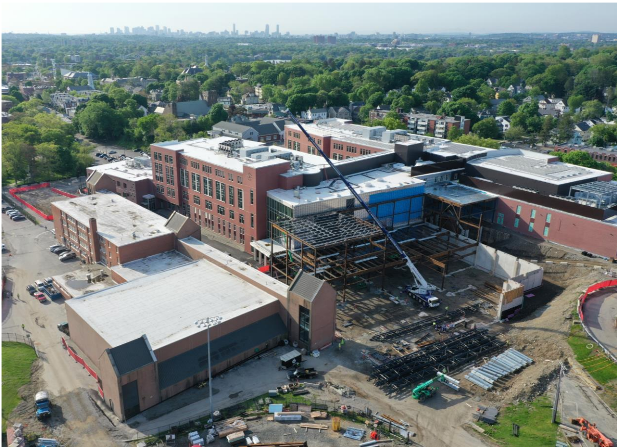
Photograph 2: Site Aerial View