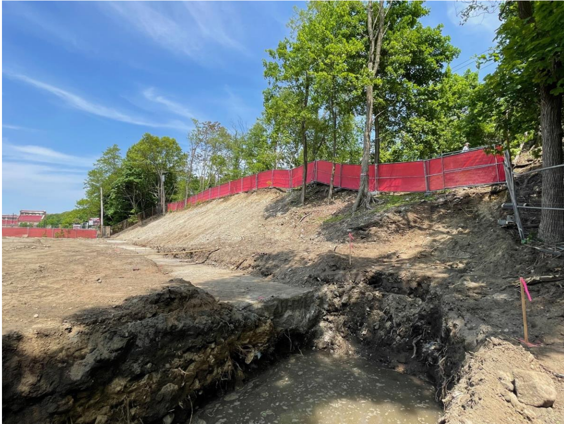
Photograph 1: Bike path site work.