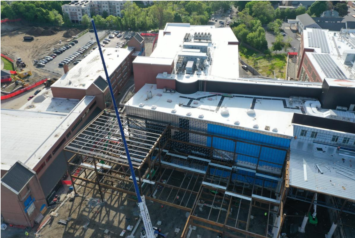
Photograph 3: Aerial View of Building A steel deck and detail.

WEEKLY UPDATE – WEEK OF JUNE 17 TH ,2024