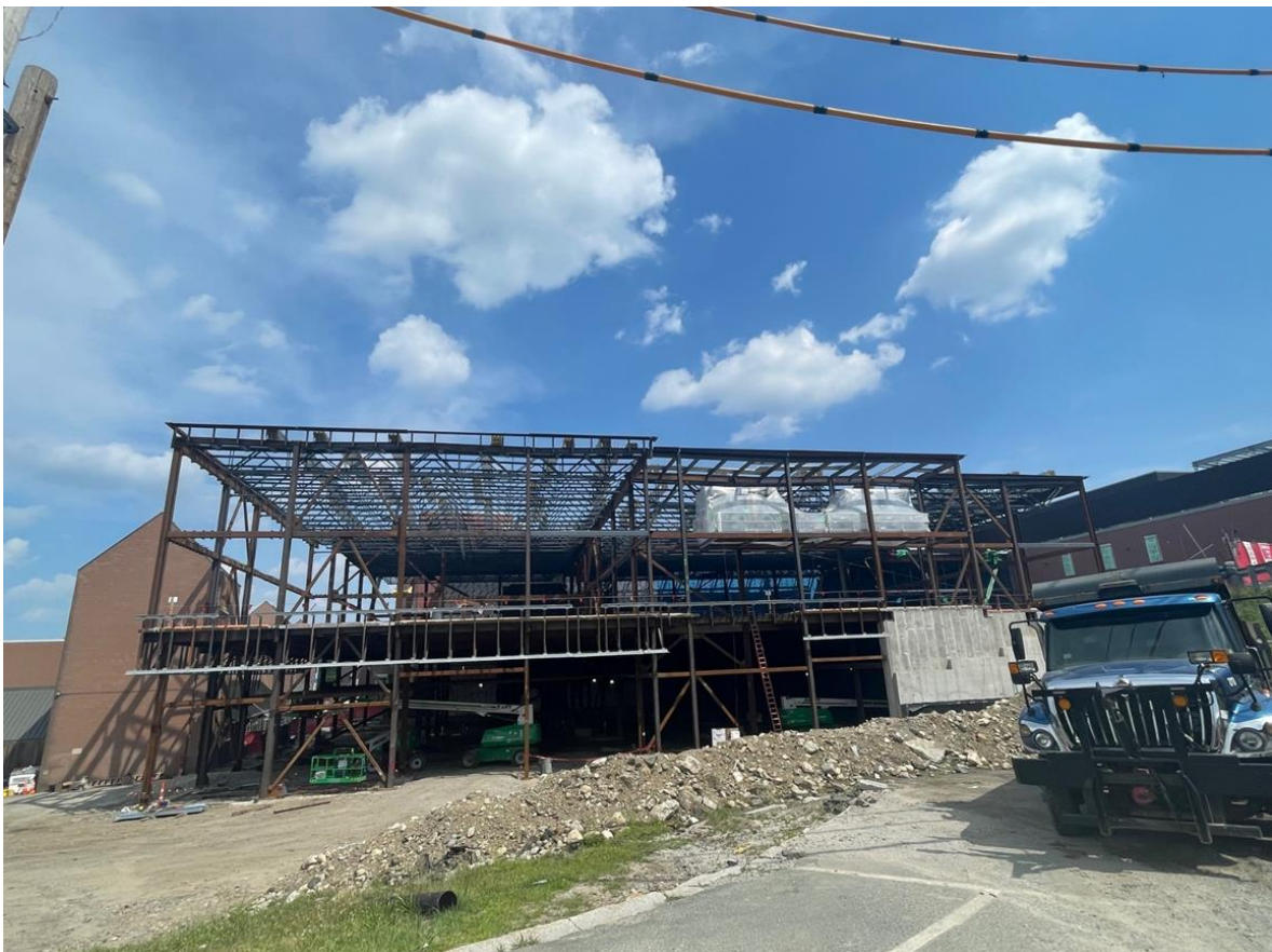
Photograph 2: West Elevation (Schouler Ct)