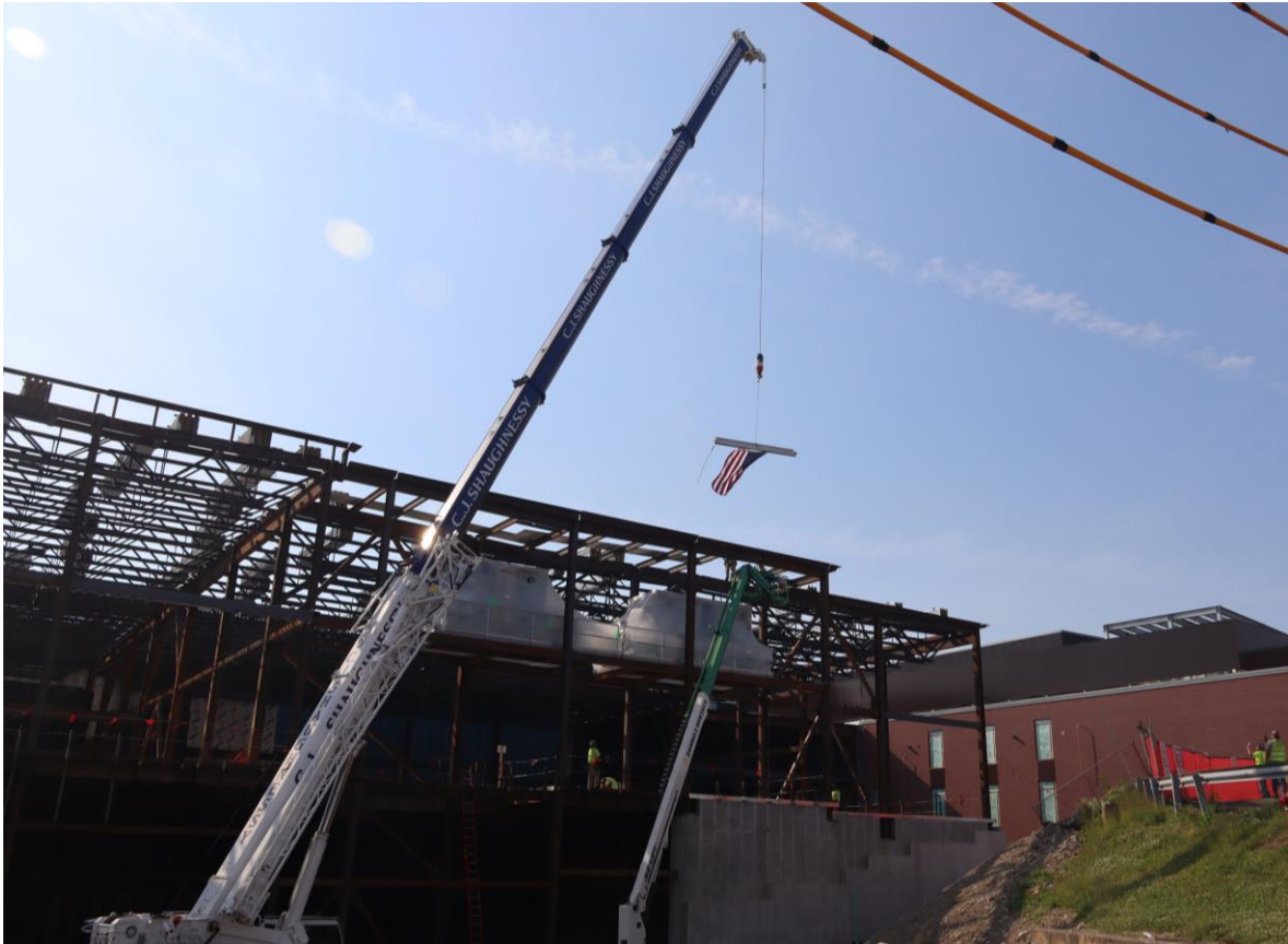
Photograph 1: Topping Off Ceremony