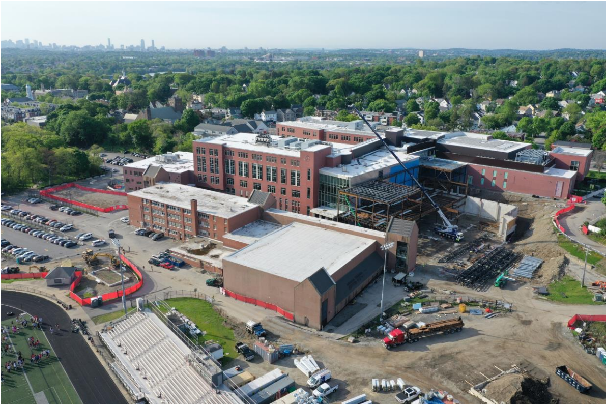
Photograph 1: Aerial View of Project