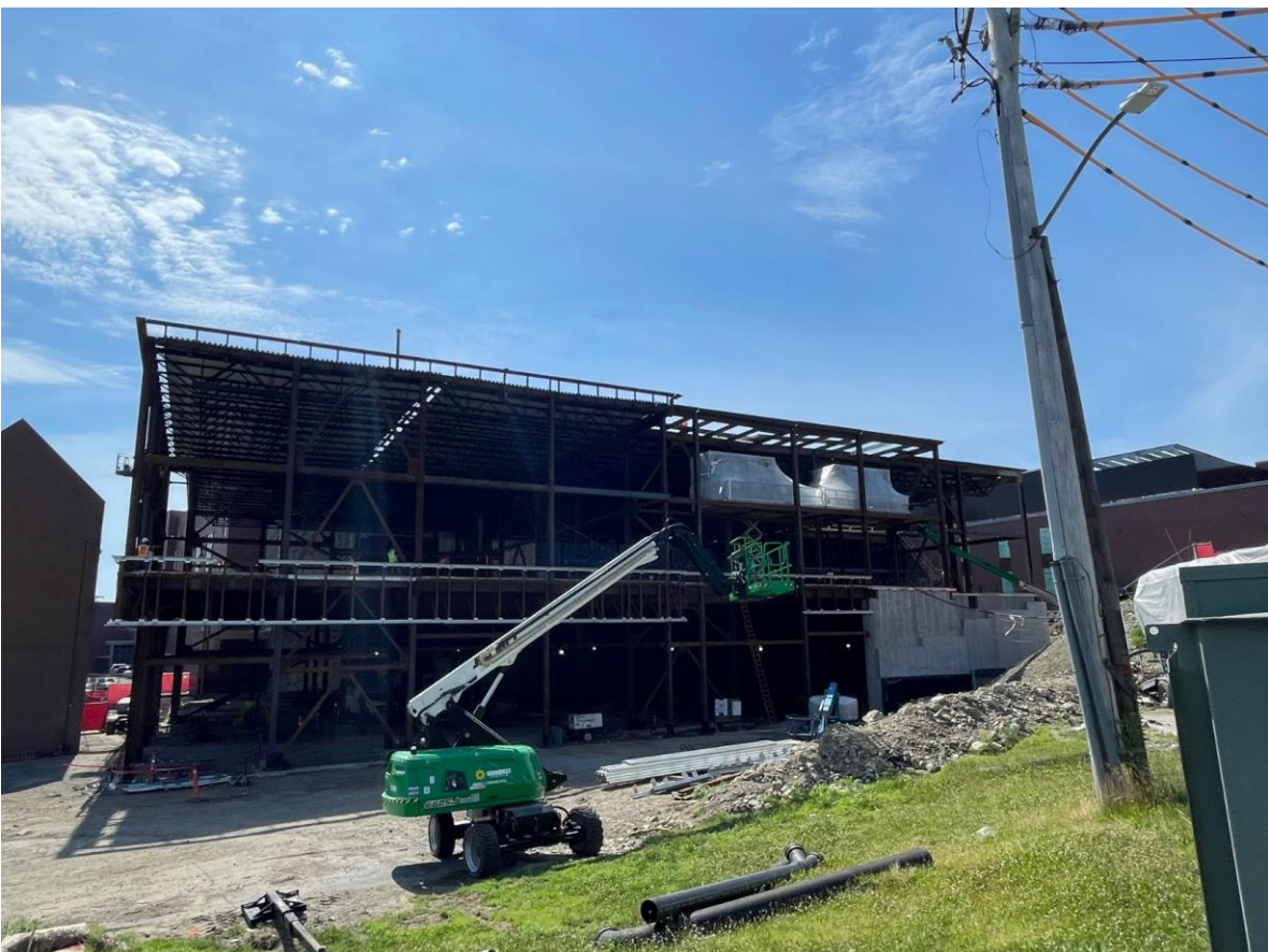
Photograph 2: West Elevation (Schouler Ct)