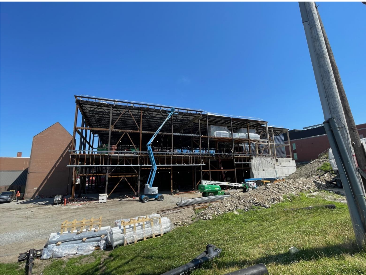
Photograph 4: West Elevation (Schouler Ct)