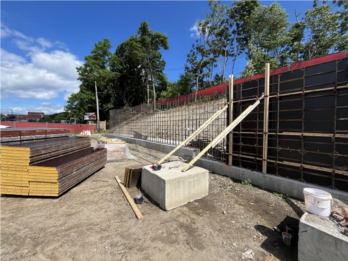
Photograph 1: Minuteman Bike Ramp Sitework and Retaining wall progress