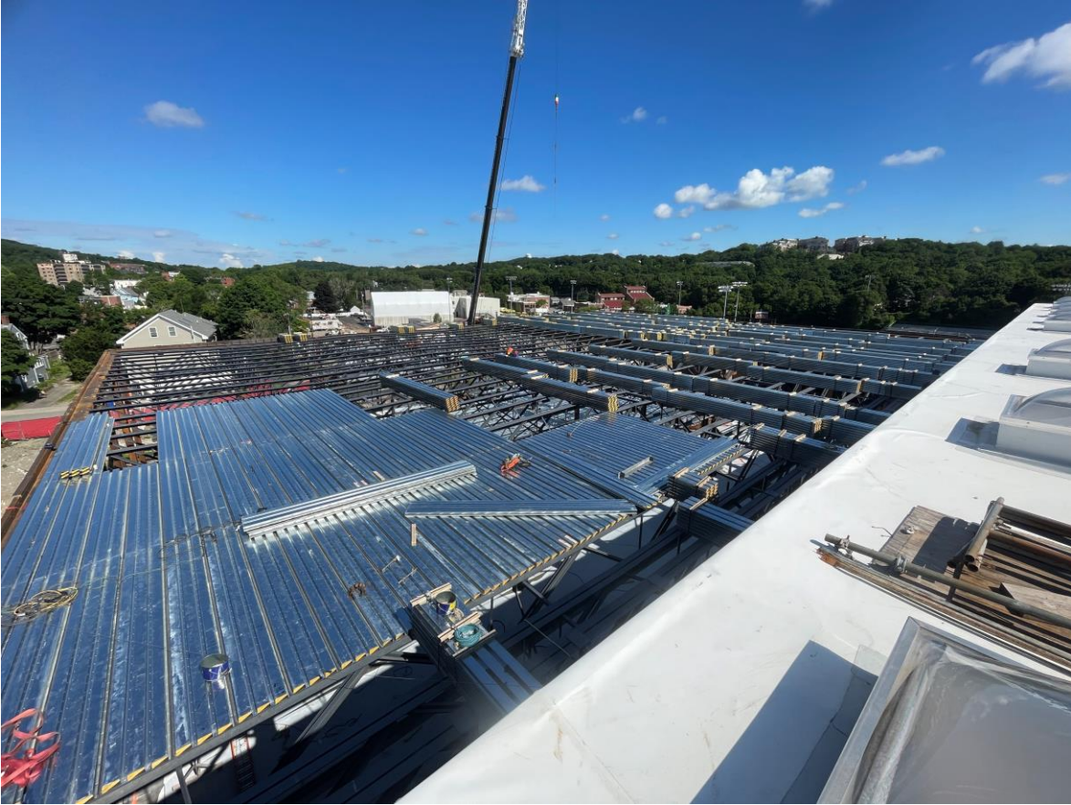
Photograph 3: Roof Deck and Detailing