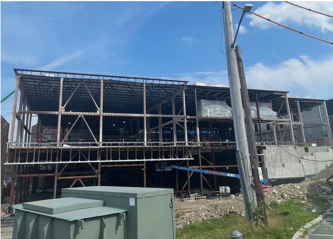
Photograph 4: West Elevation (Schouler Ct)