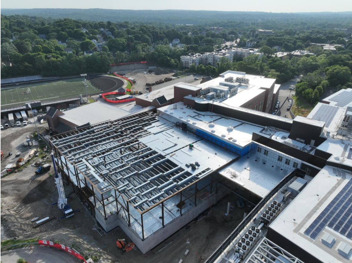
Photograph 1: Aerial View of Building A footprint.