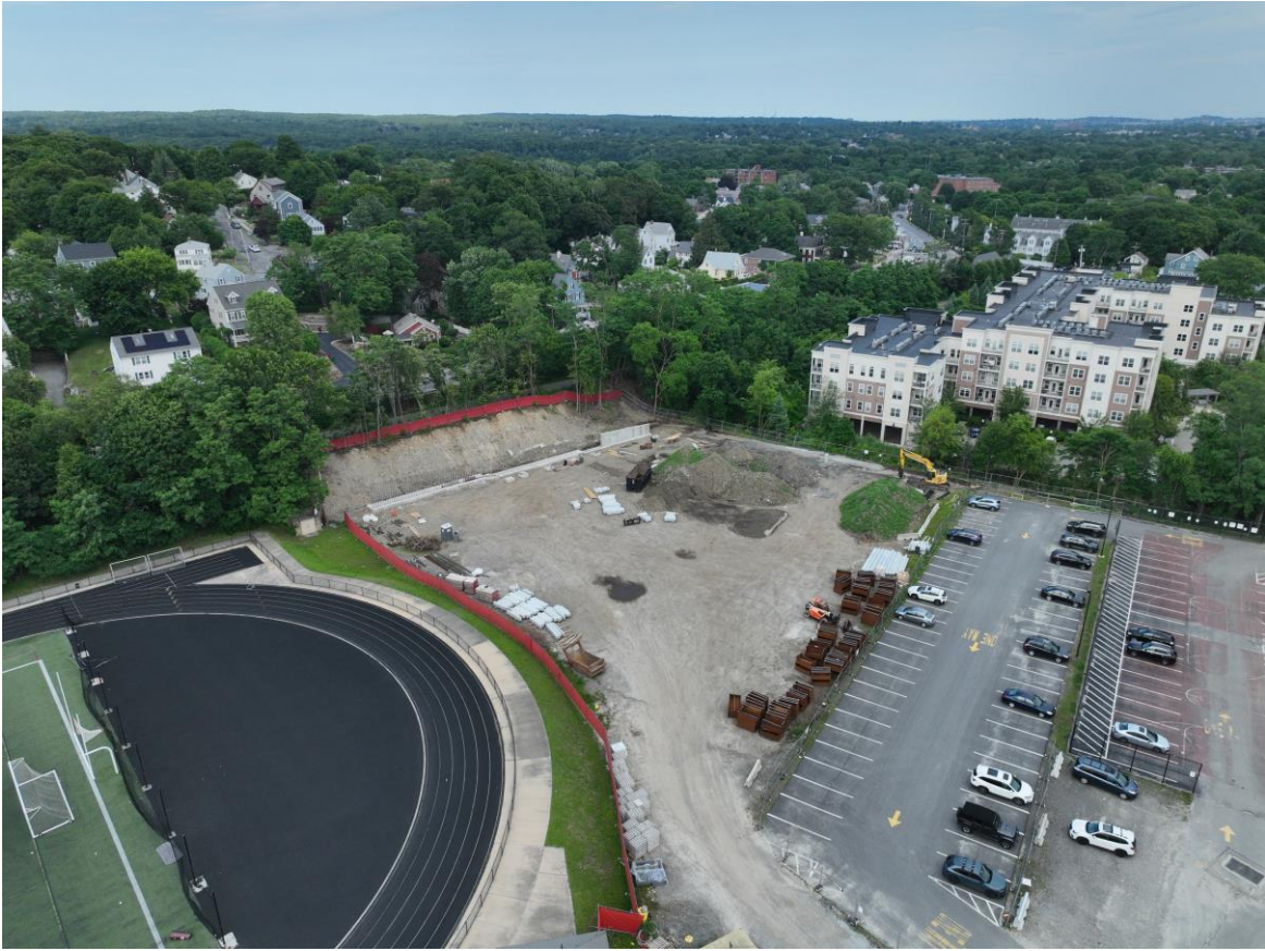
Photograph 3: Aerial View of Bike Path Progress