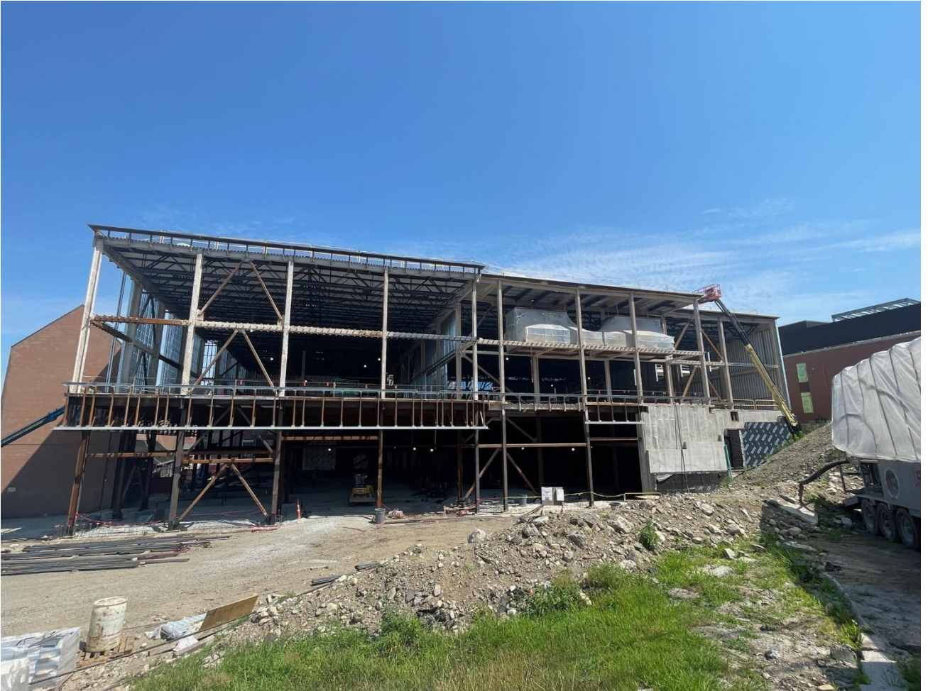
Photograph 1: West Elevation (Schouler Ct)

WEEKLY UPDATE – WEEK OF JULY 22 ND ,2024