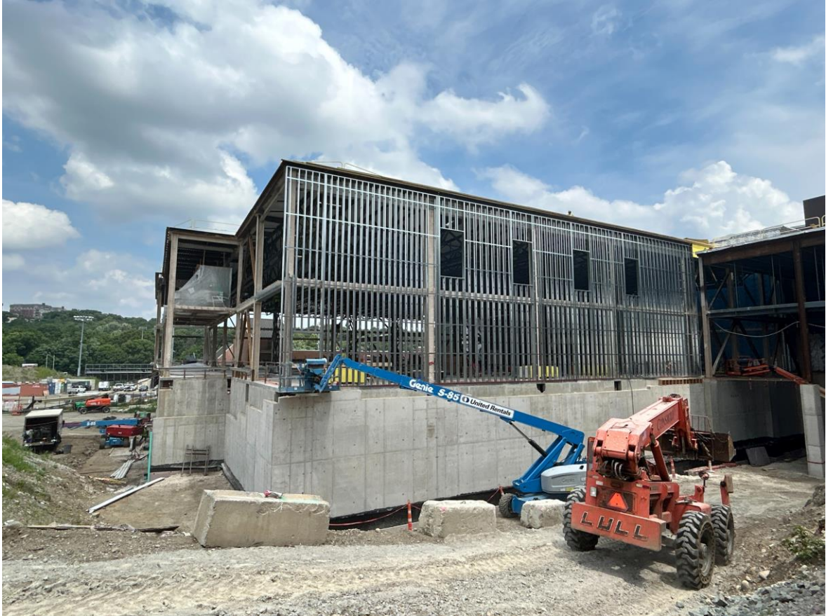
Photograph 1: Exterior Perimeter Framing