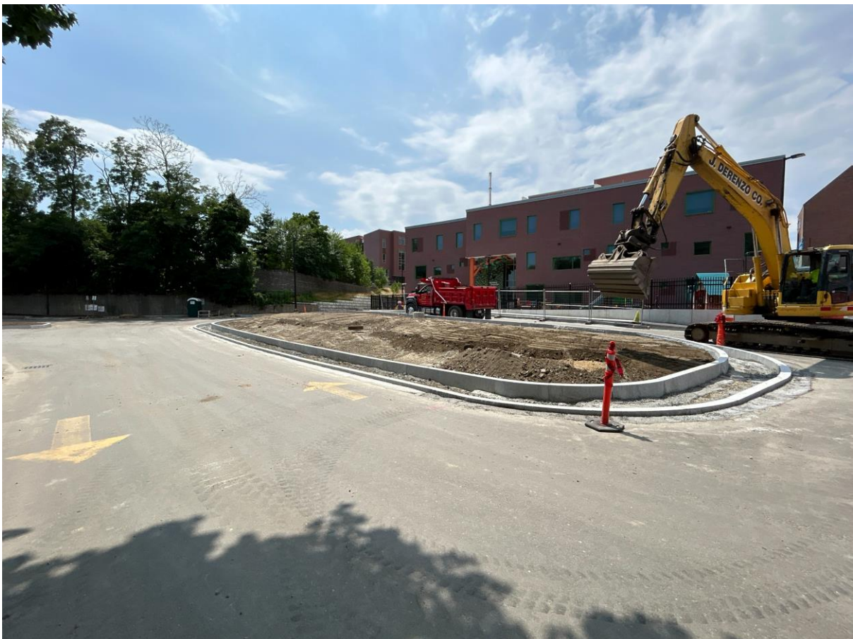
Photograph 4: Pre-K curb and sidewalk installation.