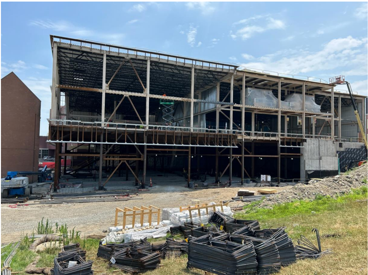
Photograph 2: West Elevation (Schouler Ct)