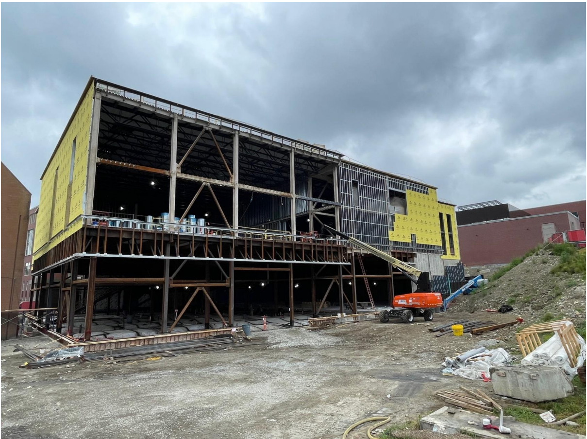
Photograph 4: West Elevation (Shouler Ct).