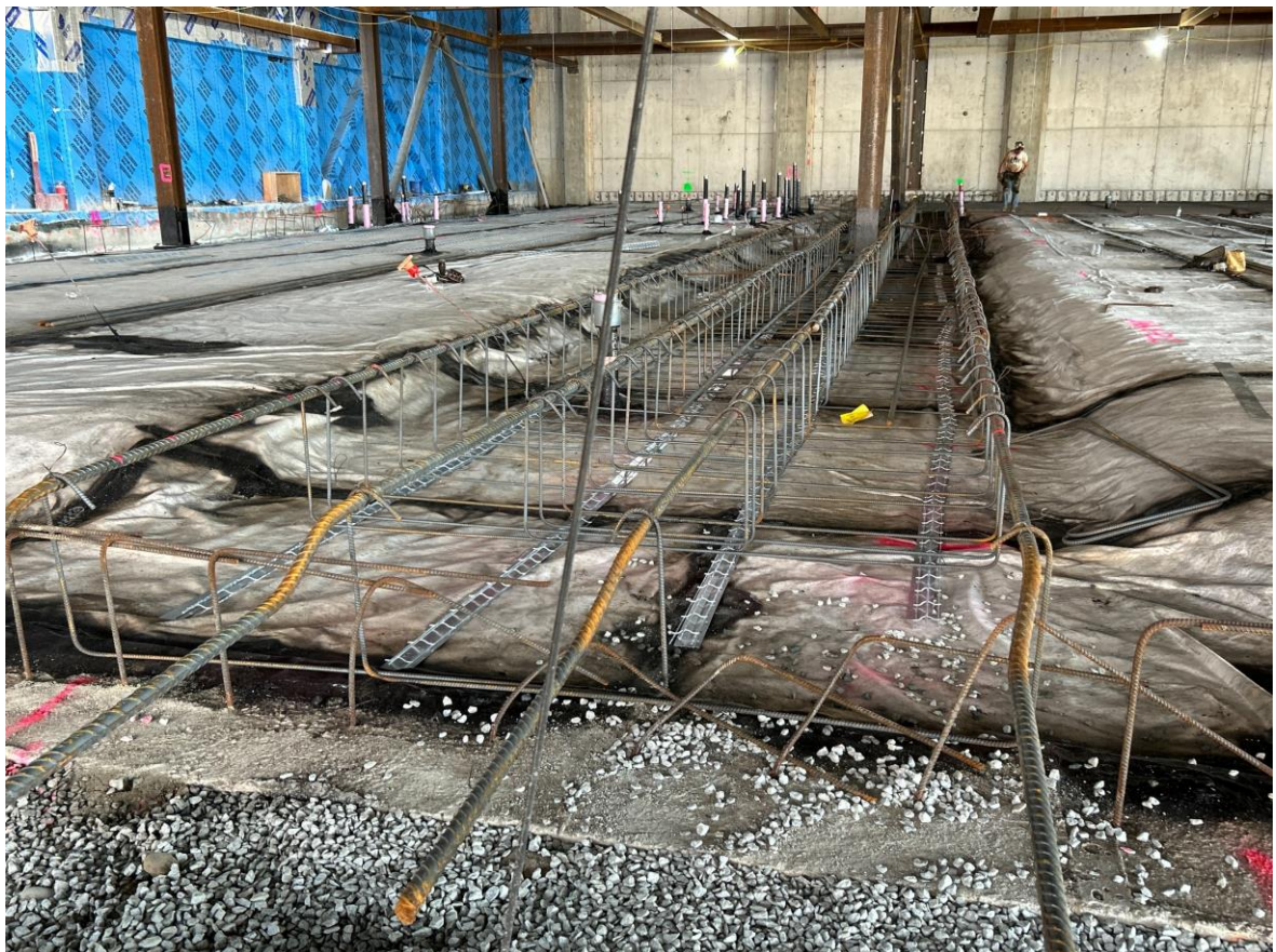
Photograph 2: Level 1 Rebar installation and vapor barrier progress.