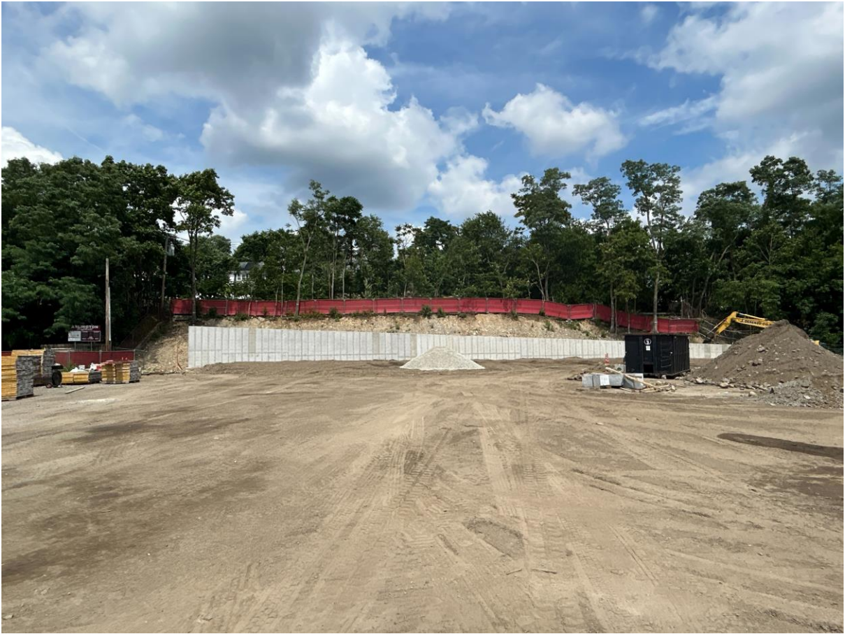
Photograph 3: Bike Path Progress