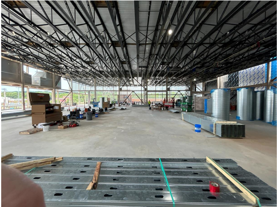
Photograph 1: Interior progress and duct installation.