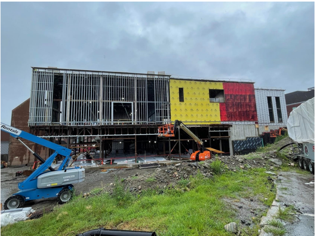
Photograph 2: West Elevation (Shouler Ct).