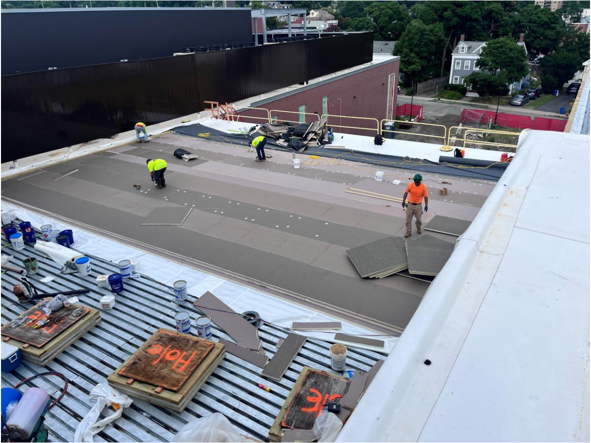
Photograph 1: Roof Progress