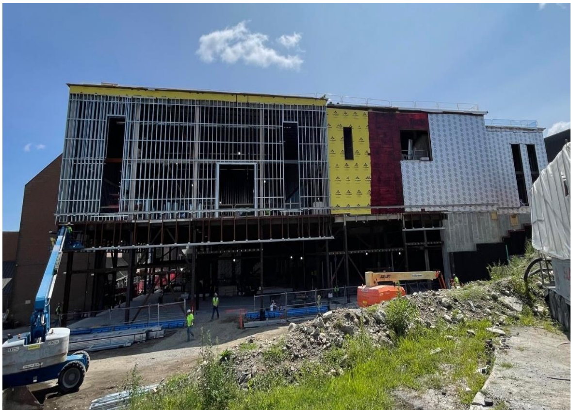
Photograph 2: West Elevation (Shouler Ct).