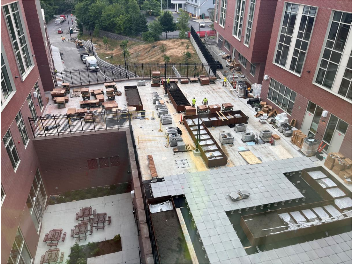
Photograph 1: Aerial view of courtyard plaza.