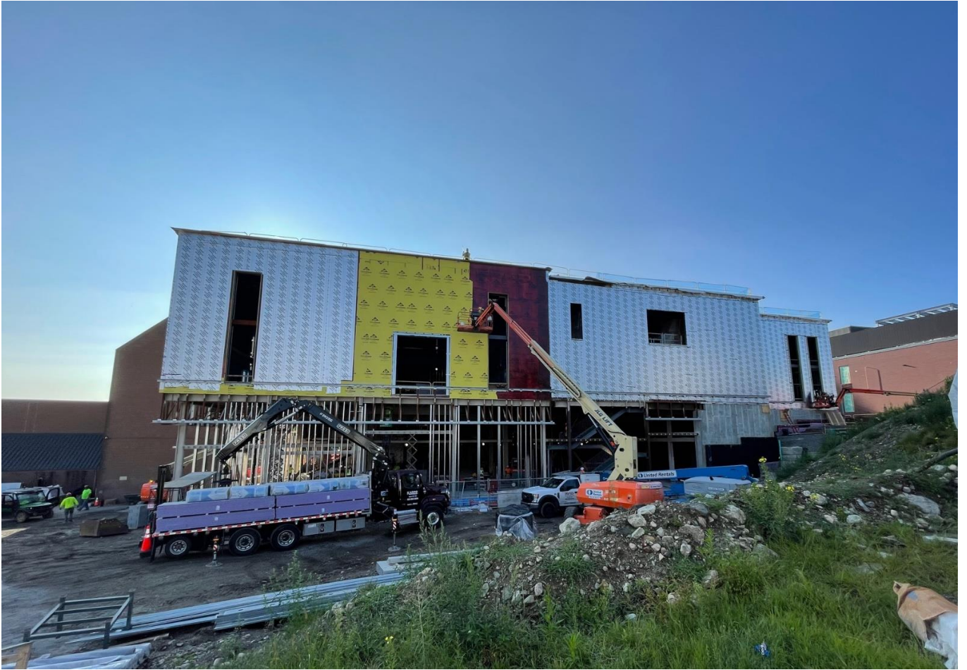
Photograph 1: West Elevation (Shouler Ct).

WEEKLY UPDATE – WEEK OF AUGUST 26 TH , 2024