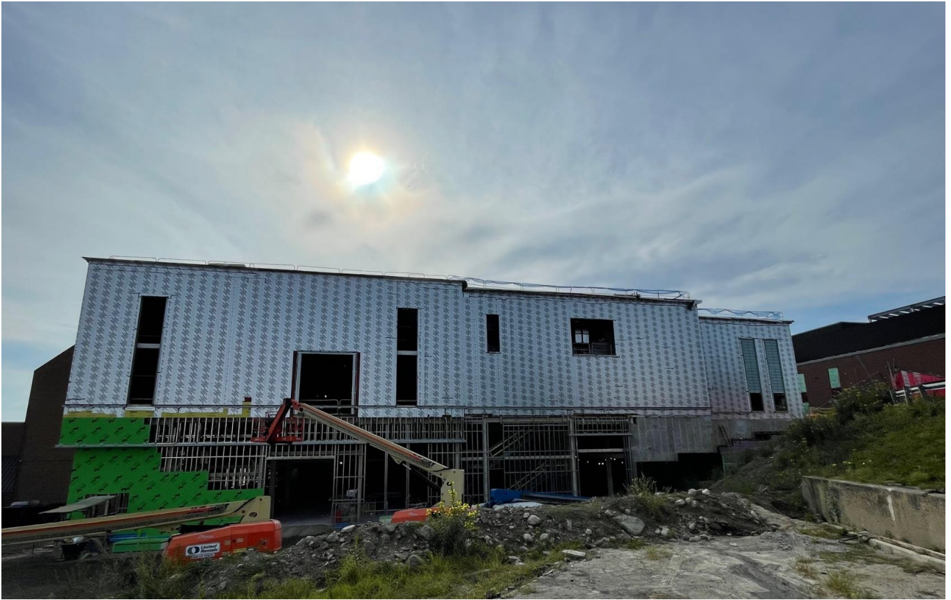
Photograph 1: West Elevation (Schouler Ct).

WEEKLY UPDATE – WEEK OF SEPTEMBER 2 ND , 2024