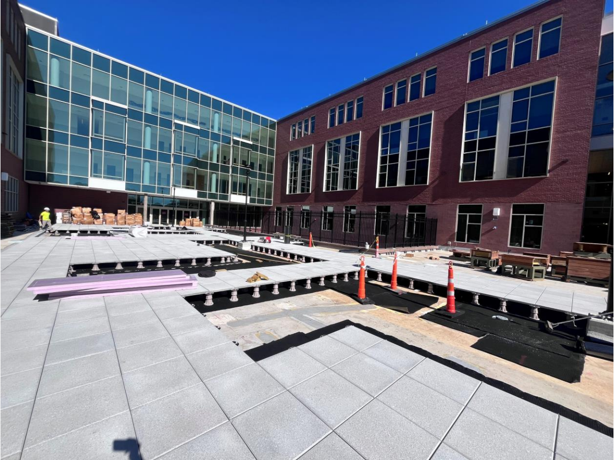
Photograph 3: Exterior Courtyard Plaza paver installation progress.