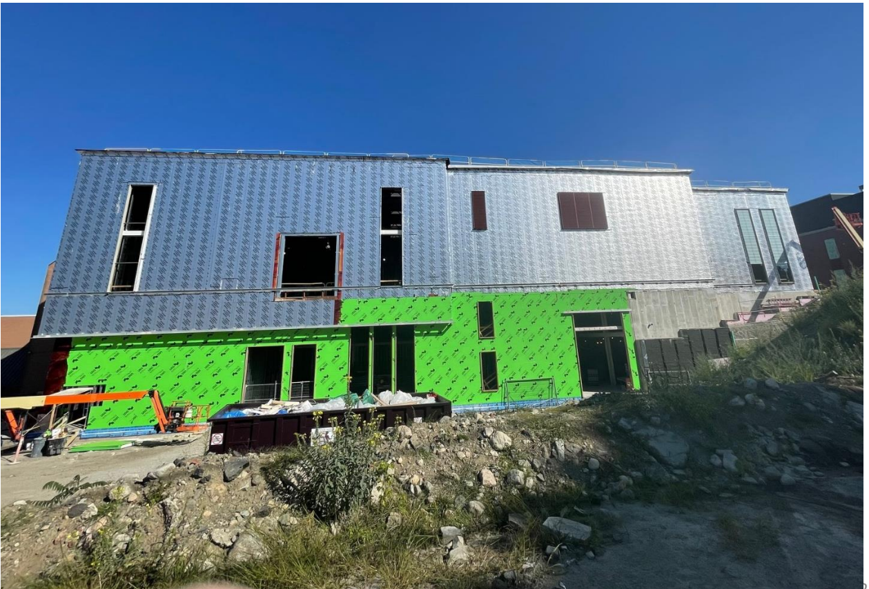
Photograph 4: West Elevation (Schouler Ct).