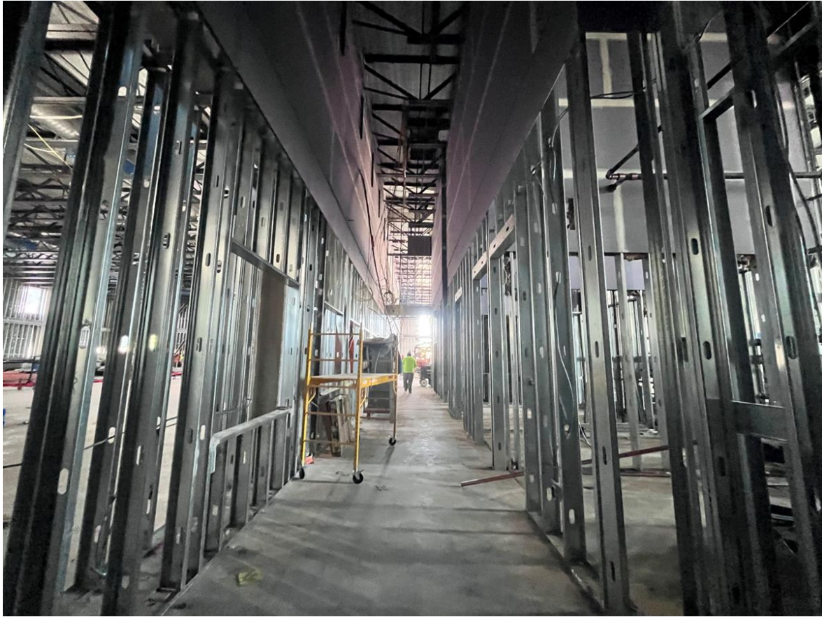
Photograph 1: Level 2 interior framing hallway progress.