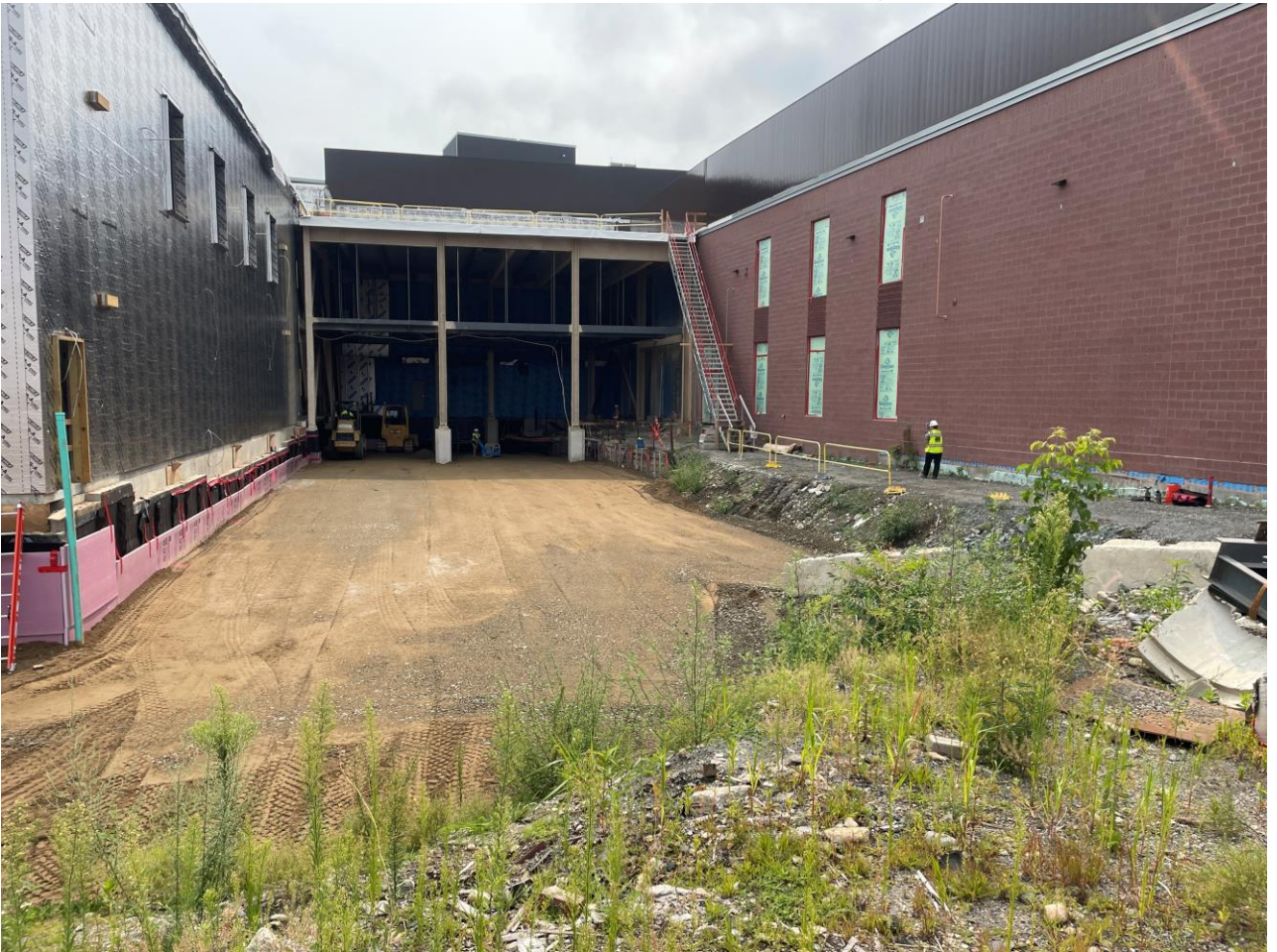
Photograph 1: Amphitheater site backfill progress.

WEEKLY UPDATE – WEEK OF SEPTEMBER 16 TH , 2024