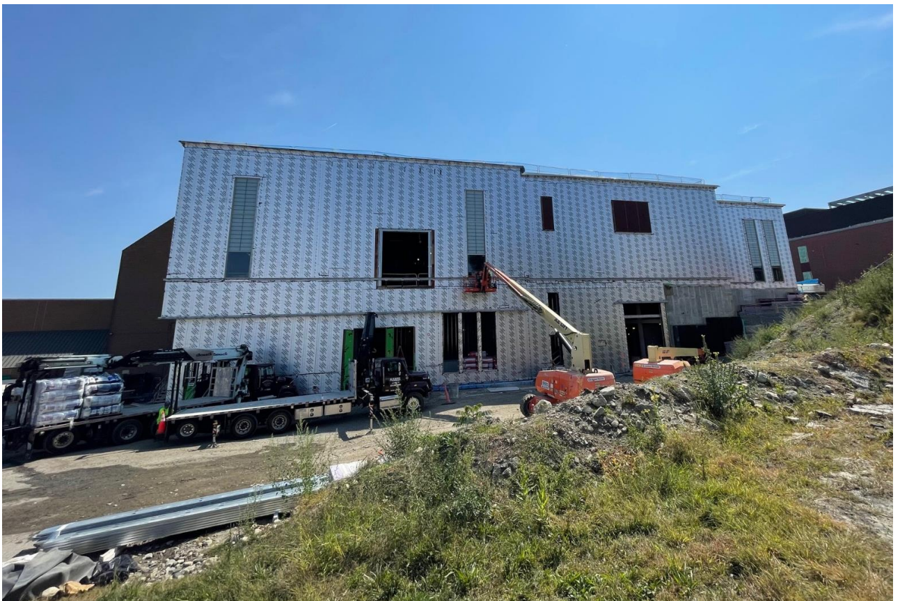
Photograph 2: West Elevation (Schouler Ct).