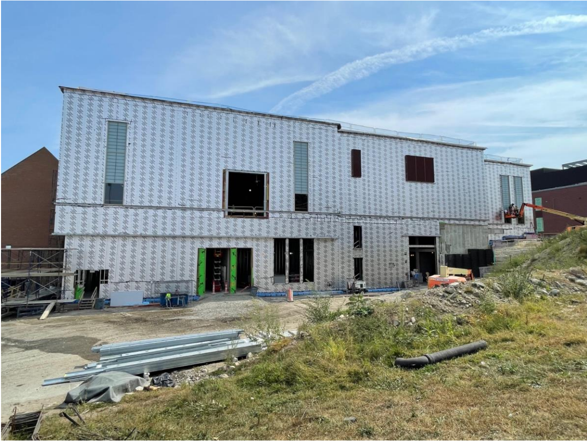
Photograph 1: West Elevation (Schouler Ct).

WEEKLY UPDATE – WEEK OF SEPTEMBER 23 RD , 2024