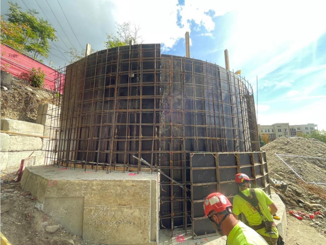
Photograph 3: Rebar of radius at Minuteman Bike Path Ramp.