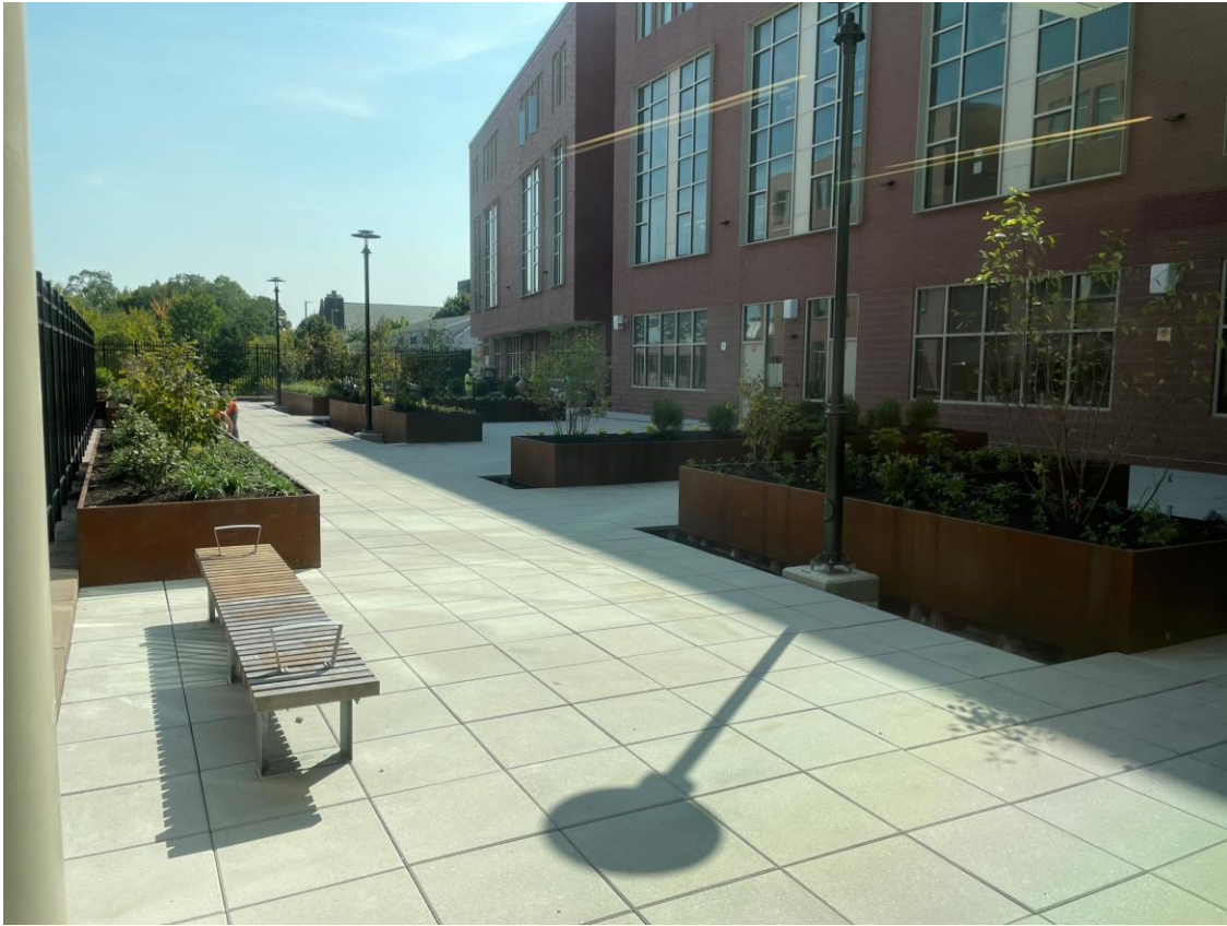
Photograph 1: Planters and benches installed at plaza.

WEEKLY UPDATE – WEEK OF SEPTEMBER 30 TH , 2024