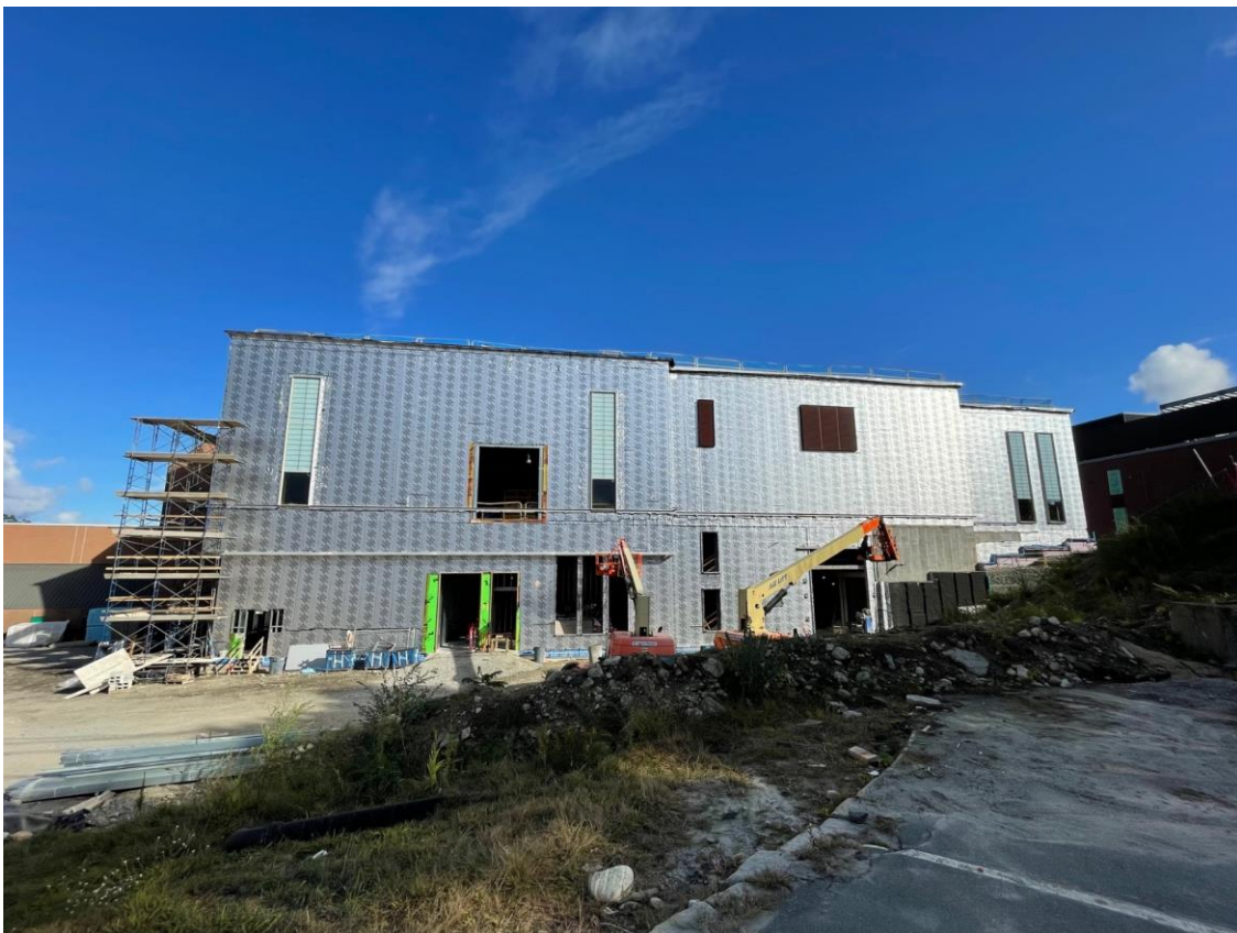
Photograph 2: West Elevation (Schouler Ct).