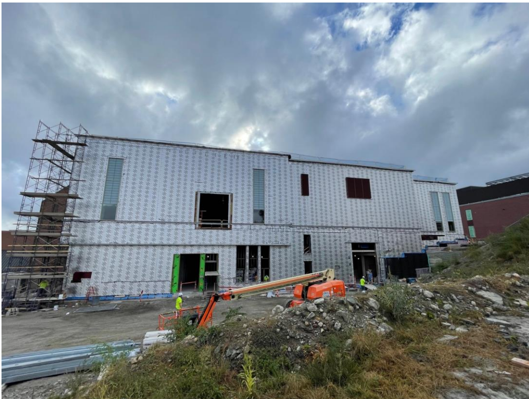
Photograph 2: West Elevation (Schouler Ct).