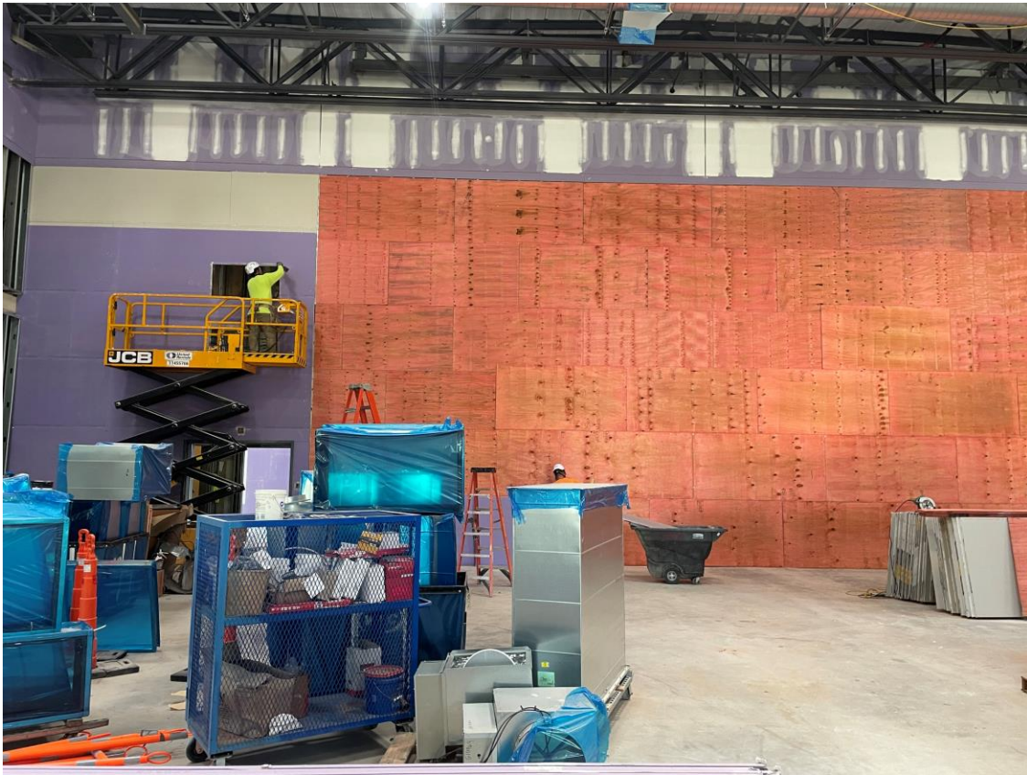
Photograph 1: Backing for future climbing wall in Alternative PE gym