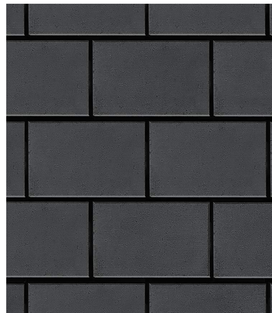
Hydra 'Onyx Black' Pervious Paver by Techo-bloc