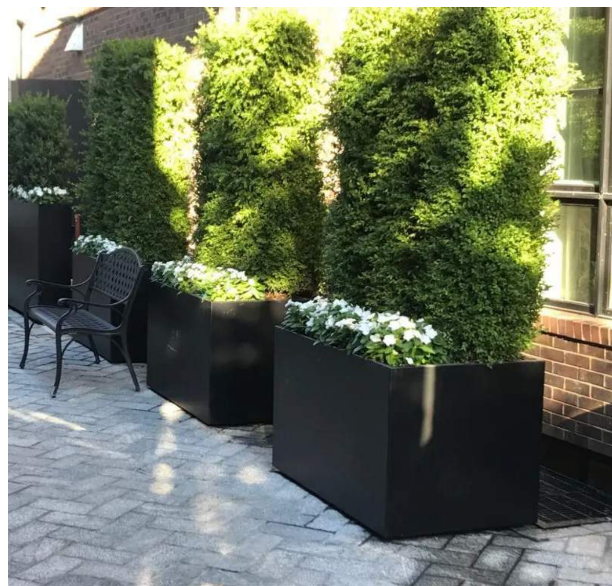
Lightweight Planters by Bison OR SIMILAR