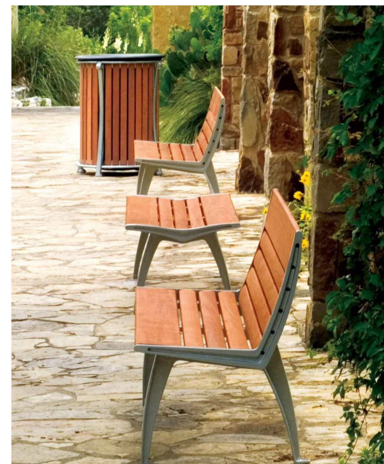
'Austin' Bench by Landscape Forms