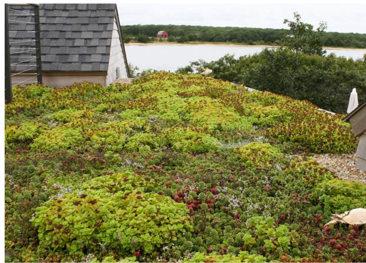
Sedum Green Roof