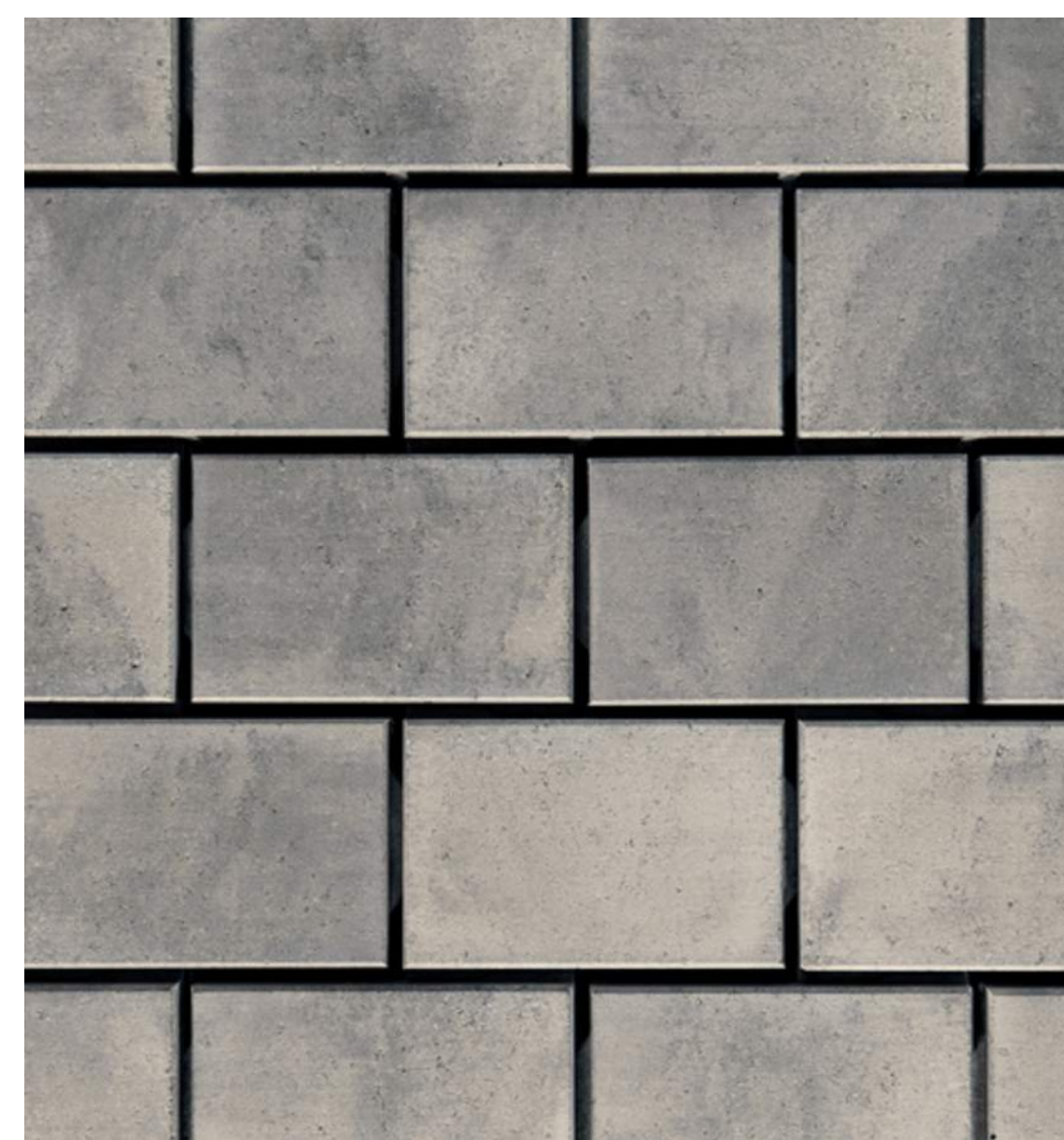
Hydra 'Shale Grey' Pervious Paver by Techo-bloc