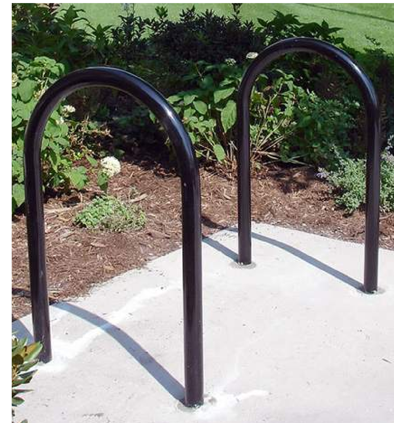
Visitor Bike Racks