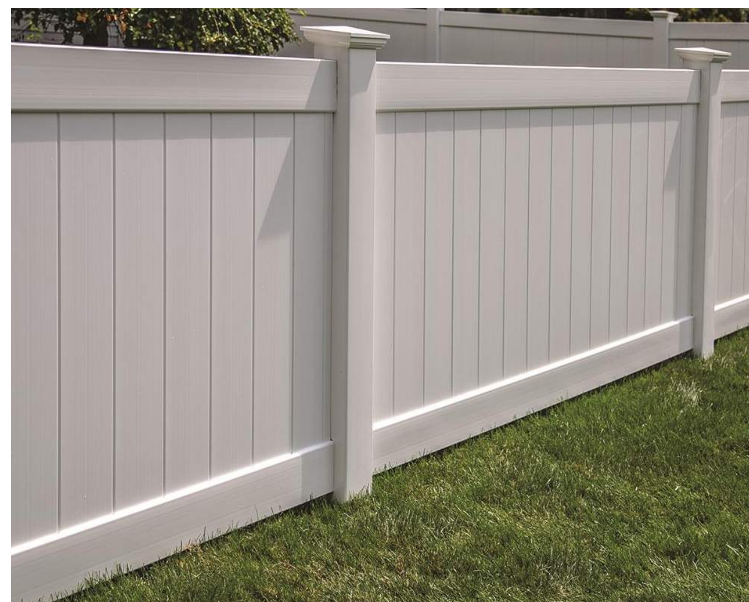
42" Ht. Board Fence