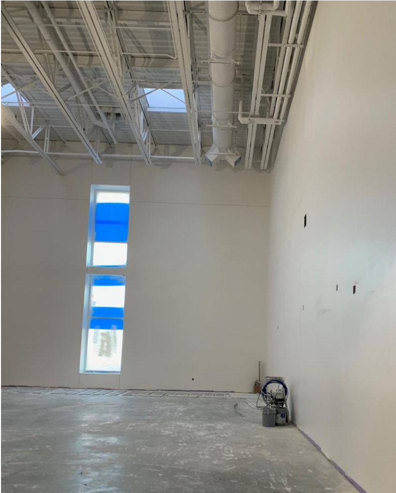
Photograph 1: Gym painted