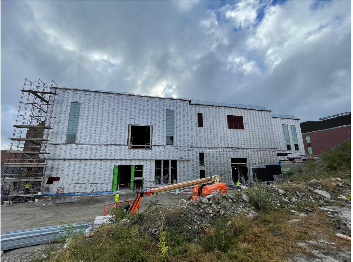
Photograph 3: West Elevation (Schouler Ct.)

WEEKLY UPDATE – WEEK OF OCTOBER 21 ST , 2024