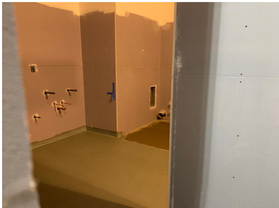
Photograph 2: Waterproofing bathroom floor