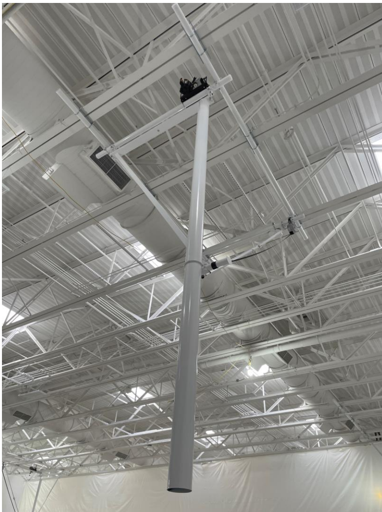
Photograph 2: Gym Equipment – Support for scoreboard