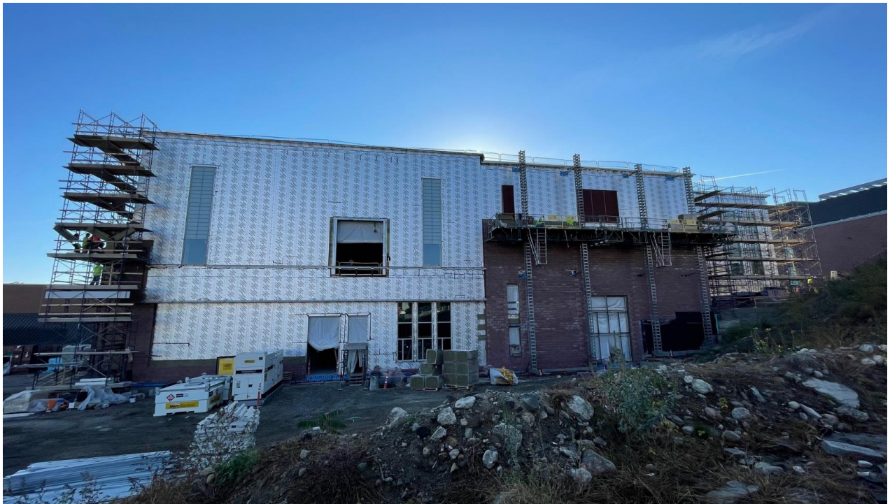
Photograph 1: West Elevation (Schouler Ct.)

WEEKLY UPDATE – WEEK OF OCTOBER 28 TH , 2024