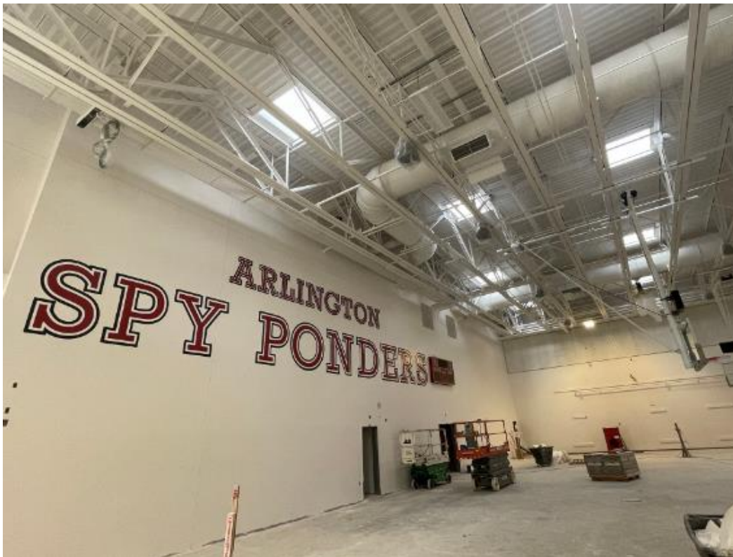
Photograph 2: Gym