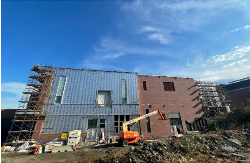
Photograph 1: West Elevation (Schouler Ct.)