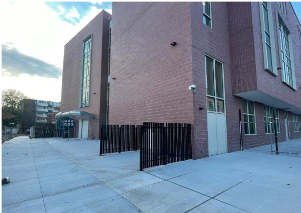
Photograph 4: Concrete from Courtyard Plaza out to Mass Ave.