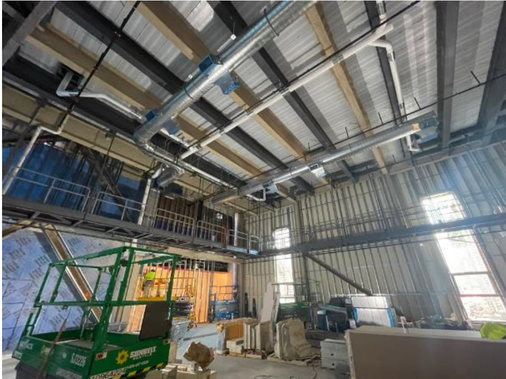
Photograph 3: Blackbox Theater