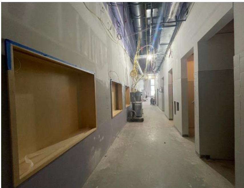
Photograph 4: Corridor construction progress.