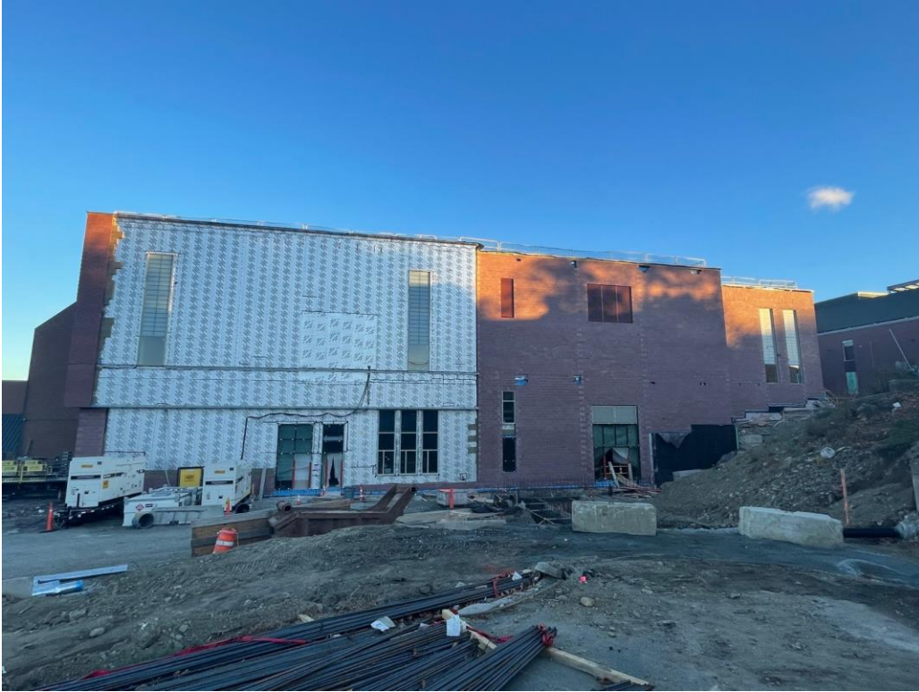
Photograph 1: West Elevation (Schouler Ct.)