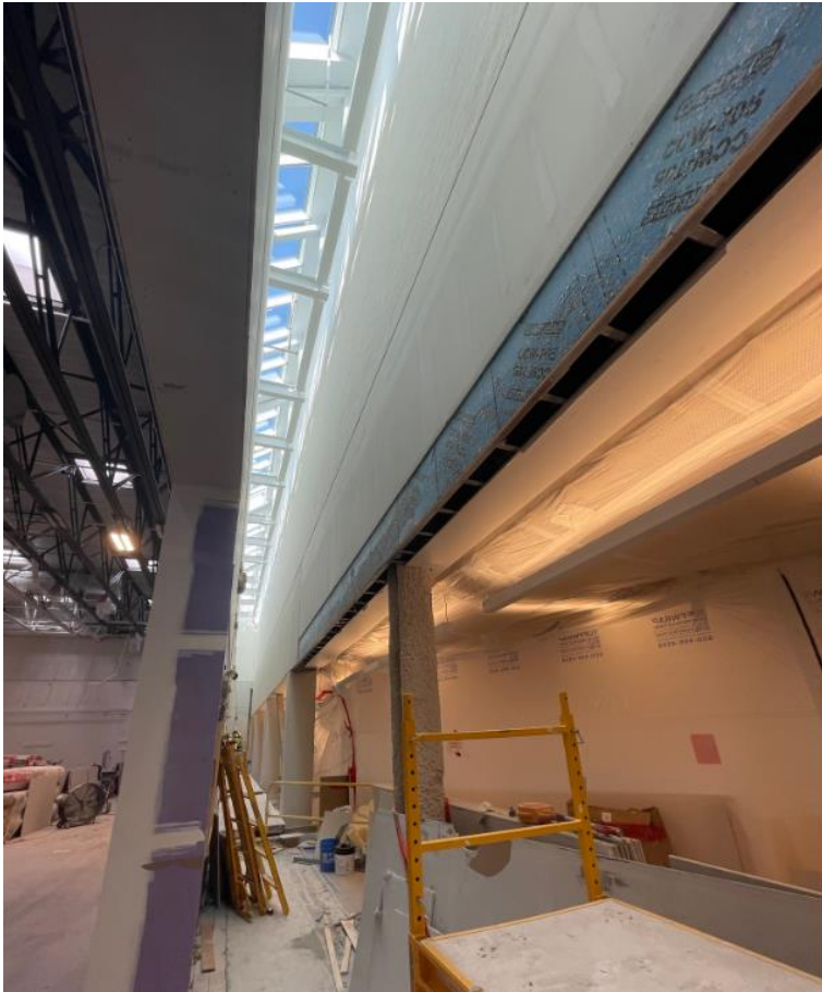
Photograph 3: Phase 2 and Phase 3 Tie-In Point