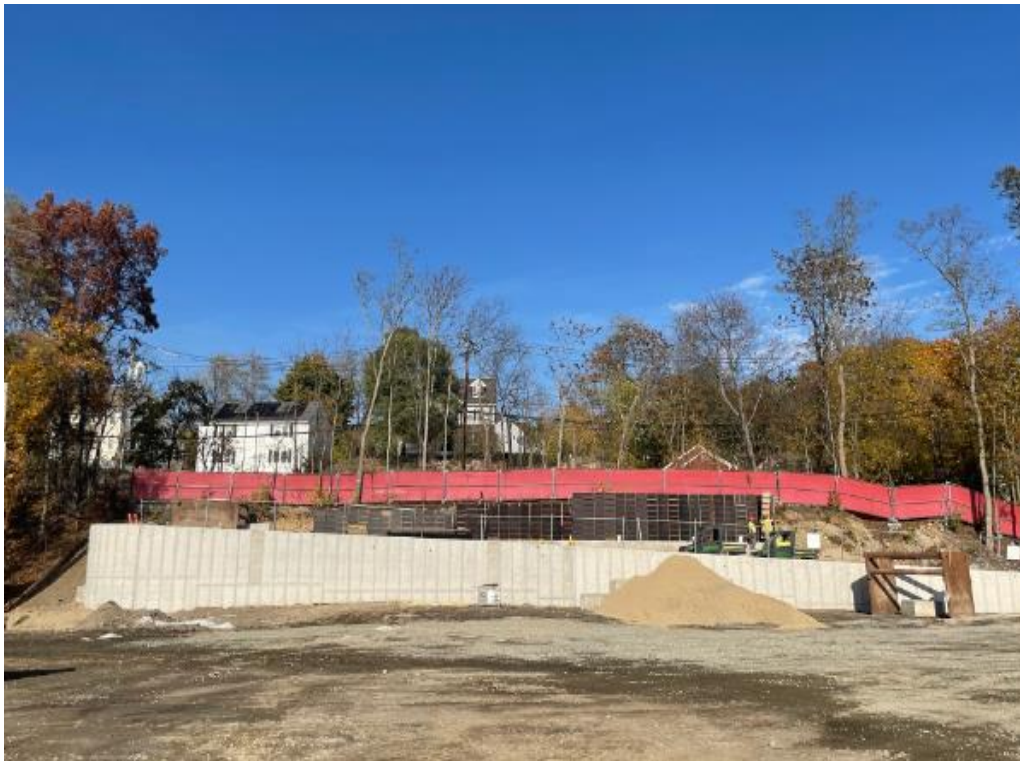
Photograph 2: Bike ramp construction progress